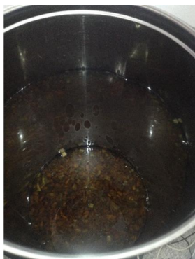
Figure 11 Maturing tincture

The harvested roots are washed and dried in Excalibur food dehydrators for the production of root powder which then gets sent to another firm to be filled into capsules. The fresh roots are cut into centimetre pieces and then in stainless steel barrels to a ratio of 1 / 1. Left for 3 months to soak, the then finished extract is bottled and dispatched. The leaves until 2015 were also dried and sold as tea but they were told that that is no longer allowed under the German food act. So now they sell it as dried Teasle leaves that could be used as tea.