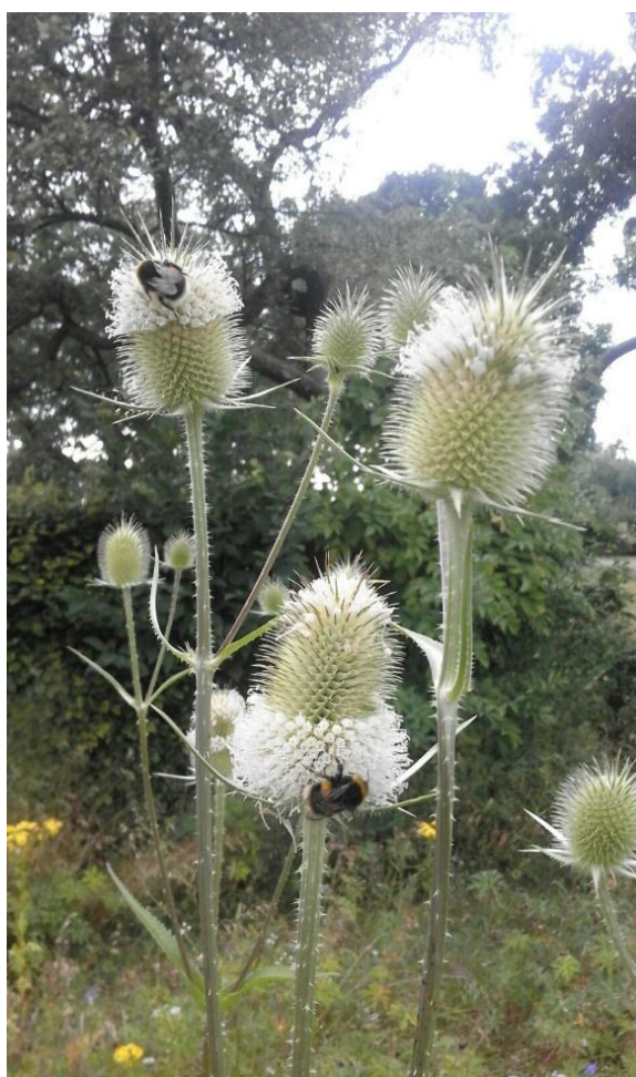
Figure 3 Dipsacus Laciniatus .

3.3 D. strigosus , the thin teasle, similar to the hairy teasle but with denser spherical flower heads and green anthers giving it a greener appearance.