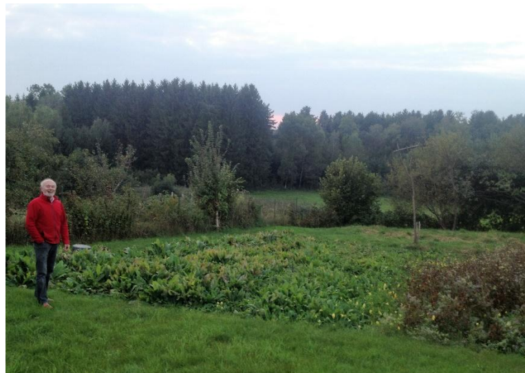
Figure 10. Edgar and his 20 x 15 m Plot of Teasle which cotributes to about 10 % of the total amount needed for thier production. Back right is a perch for birds of prey to sit. This helps control the mice. Good to know!

from Edgar is not enough and he employs partly organic and partly Biodynamic farmers to help produce the crop needed. He explained that the farming is all done by hand to minimalize damage to the roots so no rot can set in, spoiling the quality of the end product.