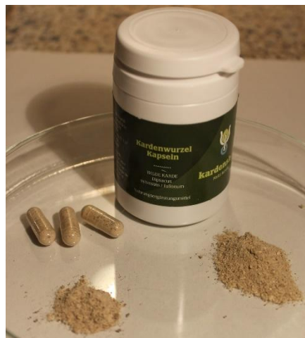
Figure 12 Finished product. Left powder from an opened capsule. Right my own powder as a comparison.

The harvested roots are washed and dried in Excalibur food dehydrators for the production of root powder which then gets sent to another firm to be filled into capsules. The fresh roots are cut into centimetre pieces and then in stainless steel barrels to a ratio of 1 / 1. Left for 3 months to soak, the then finished extract is bottled and dispatched. The leaves until 2015 were also dried and sold as tea but they were told that that is no longer allowed under the German food act. So now they sell it as dried Teasle leaves that could be used as tea.