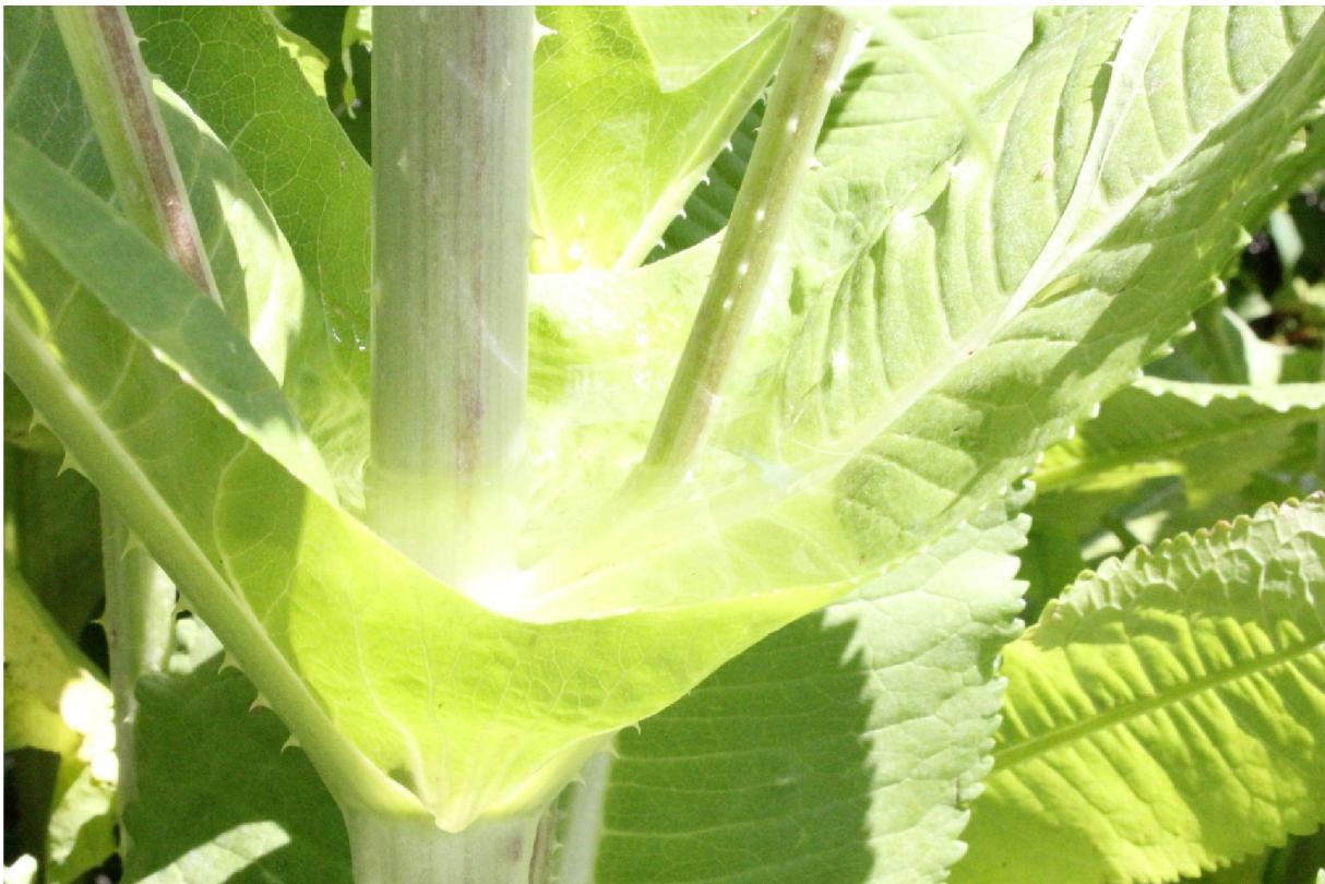
Figure 15 Dipsacus fullonum / sativus Venus`s cups.

14.8 This research from China strangely focuses on the detoxifying effects of the leaf of Dipsacus sativus not the root and not the Chinese Xu Duan. Published in 2016 and titled: Multi-Component HPLC Analysis and Antioxidant Activity Characterization of Extracts from Dipsacus sativus (Linn.) Honck 22 This work focuses mainly on HPLC techniques and goes in to some detail explaining how they found eight main components, “Marker” components and possibly two main active components Saponarin and Isovitexin interestingly completely different active ingredients to the Xu Duan mentioned in Nr. 7 with its dipsacus saponin C. furthermore tests were once again carried out on mice which showed D. sativus leaves have significant antioxidant activities.