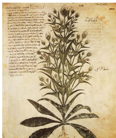
Figure 4 Teasle from the Materia Medica

5.1 The oldest known western text which includes Dipsacus is from Pedanius Dioscorides's Materia Medica which was probably written about 64 AD. Here, the teasle root is said to be ground and mixed with wine or vinegar to make a waxy paste used to heal broken skin around the anus as well as internal haemorrhoids and "stalked" warts. He also mentions the use of worms found in the old teasle flower heads which could be collected and worn in a sack around the throat or arm to heal the four-day fever (malaria).