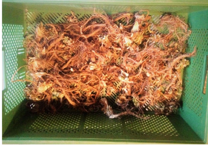
Figure 7 Dried roots from ca. 10 plants.