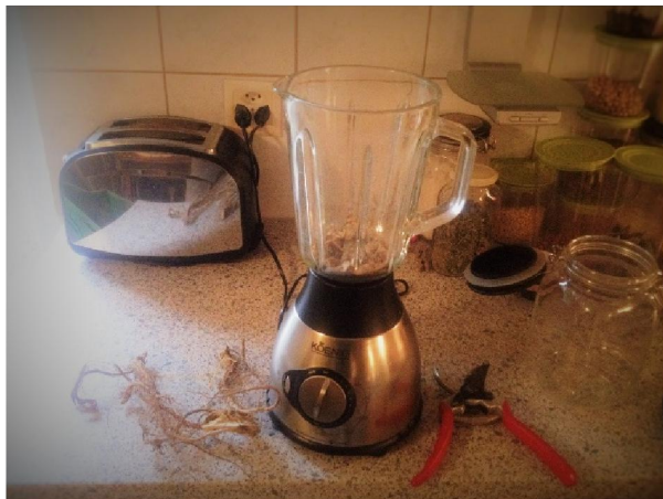
Figure 8 Milling