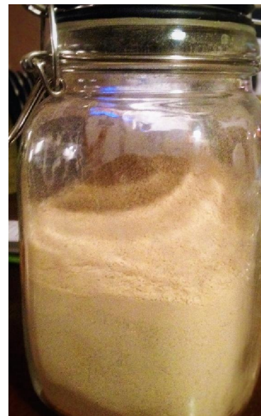
Figure 9 Final product.

Since then I have been taking a teaspoon full of this powder 3 – 4 times a week as tea or mixed in muesli. Additionally, I have been using an alcohol tincture made from the root which I take in water daily. Although it is not easy to say for sure if there is any great noticeable improvements I can be sure that there are no side effects and no progressively worsening symptoms. I also have had Borreliosis tests done (Western Blot and ELISA) before and after a 3 month period of using this medicine to see if the antibody count has changed.