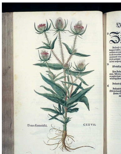
Figure 5 Teasle from Das Kreuterbuch Loenhart Fuchs 1543

5.2 Hildegard of Bingen 1098-1179 wrote about teasle in her book the Physica also called Liber simplicis medicinae written between 1150 and 1160. Here she describes the plants qualities as warm and dry with a detoxifying effect that will drive poisons from the body. She also wrote that problems such as rashes could also be treated with the powdered plant mixed with fresh lard.