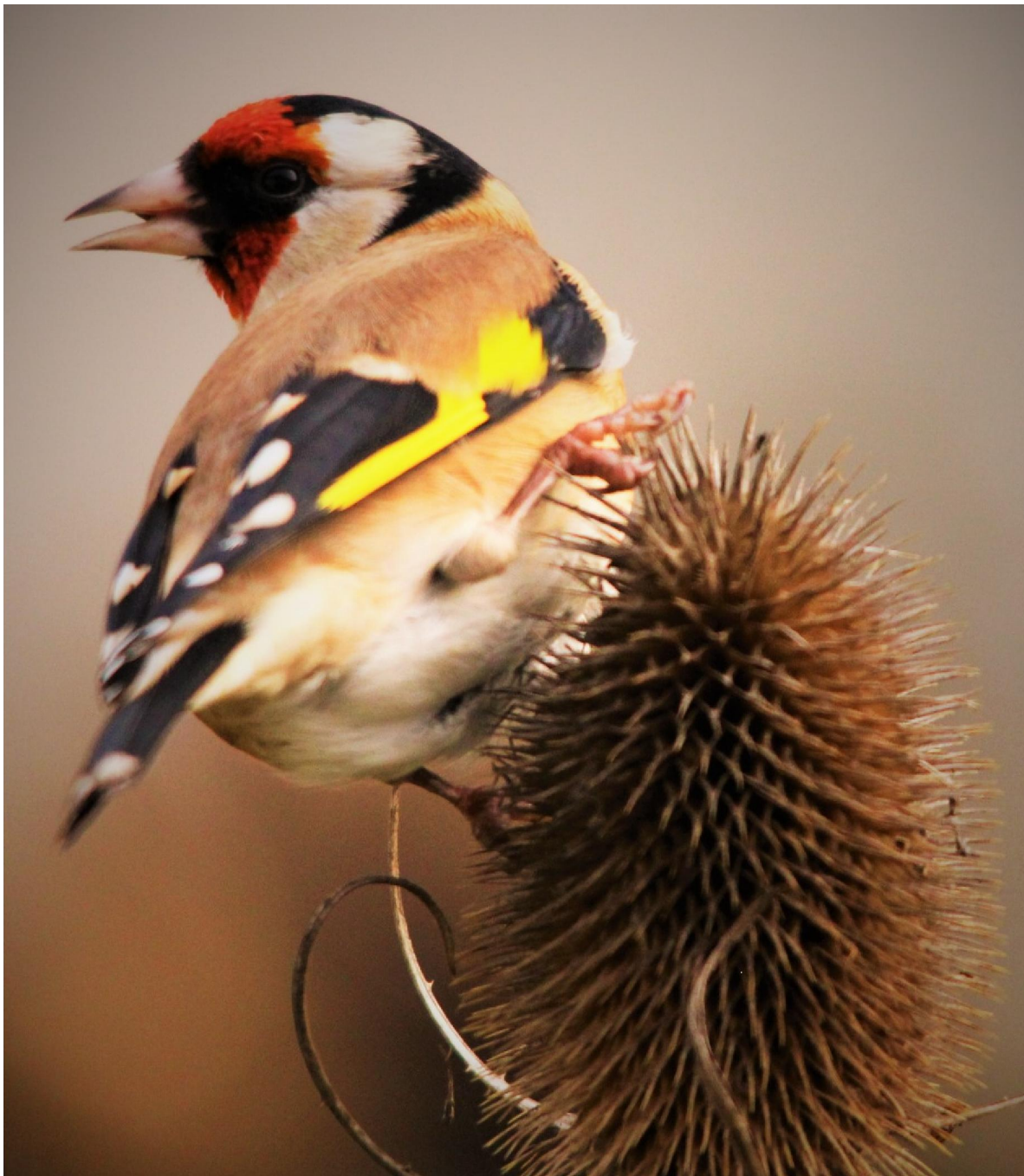
Figure 1 The European goldfinch De. Distelfink (Carduelis carduelis) feeding on a Teasle

Note: for the citation of certain information I have given numbers in small text which refer to the source in the bibliography.