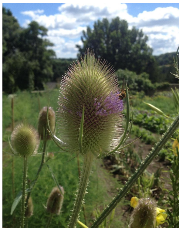
Figure 2 Dipsacus fullonum / sativus

There is however some dispute over the true origin of the Fullers Teasle. D. fullonum L. and D. sativus L. Honk. ( sativus meaning cultivated) are often named as separate species but are actually the same thing (the cultivar group being Dipsacus fullonum Sativus Group; syn. D. sativus ) 13 . This Teasle was bred for its use by Fullers (weavers) because its seed heads were regarded as superior to the wild teasle due to the longer, more flexible, slightly curved hooked bracts. Either way, I suspect through the long and historical importance of this plant throughout Europe there would have been a few supsp.