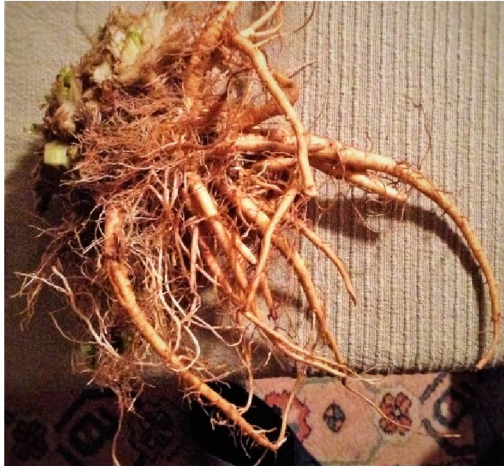
Figure 6 Washed root from 1 Teasel plant

plenty and besides, maybe the hungry mice also had Lyme disease. The roots were washed thoroughly and dried on top of a wood oven for a few days. I then used a mixer to powder them and the medicine was finished. (Figures 6-9)