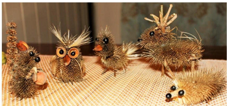
Figure 5 My attempt at making some Teasle figures ☺

7.3 One last point not to be over looked is the use of teasle heads to make toys. A large variety of prickly hedgehogs owls and deer figures etc. can be made. (Right)