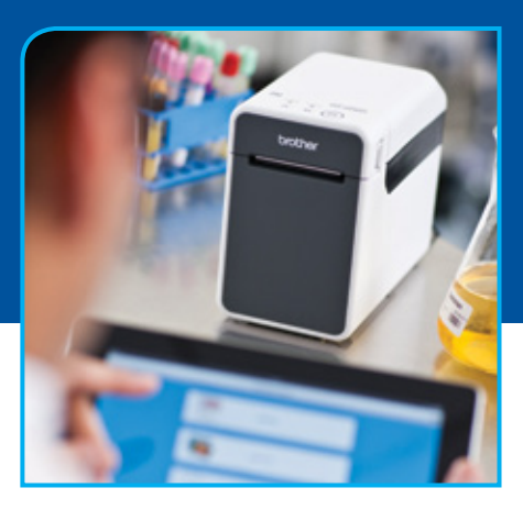
Optional Wi-Fi and Bluetooth connectivity

Conveniently located on both sides of printer for hassle-free media installation.