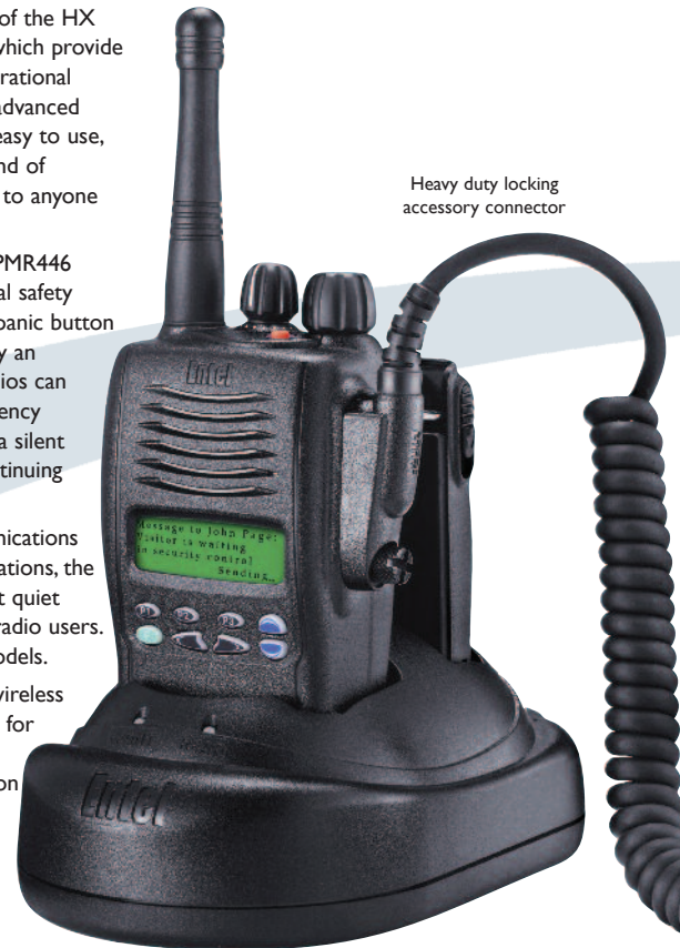
Heavy duty locking accessory connector

Bluetooth (option) – for convenience, wireless transmit is available on all models, allowing for connection of Entel's Bluetooth audio accessory range, as well as data transmission devices.