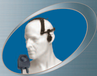
CXR5/450 skull mic