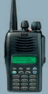
Advanced Signalling Keypad