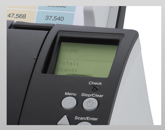
Integrated LCD operating panel

These are the first desktop scanners in the World equipped with iSOP (Intelligent Sonic Paper Protection); which detects changes in the acoustic noise generated by paper and enhances the paper feeding process. Additionally they feature innovatively developed hardware and software to help augment your daily routines and boost your organisation's efficiency.