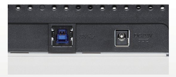
High speed performance through USB 3.0 interface