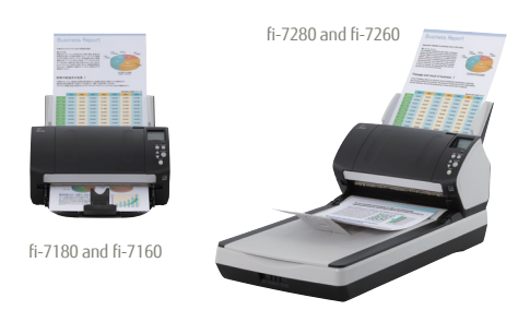
fi-7160 / fi-7260 – A4 Portrait at 300 dpi 60 ppm / 120 ipm fi-7180 / fi-7280 – A4 Portrait at 300 dpi 80 ppm / 160 ipm Scan mixed batches through the 80 sheet ADF