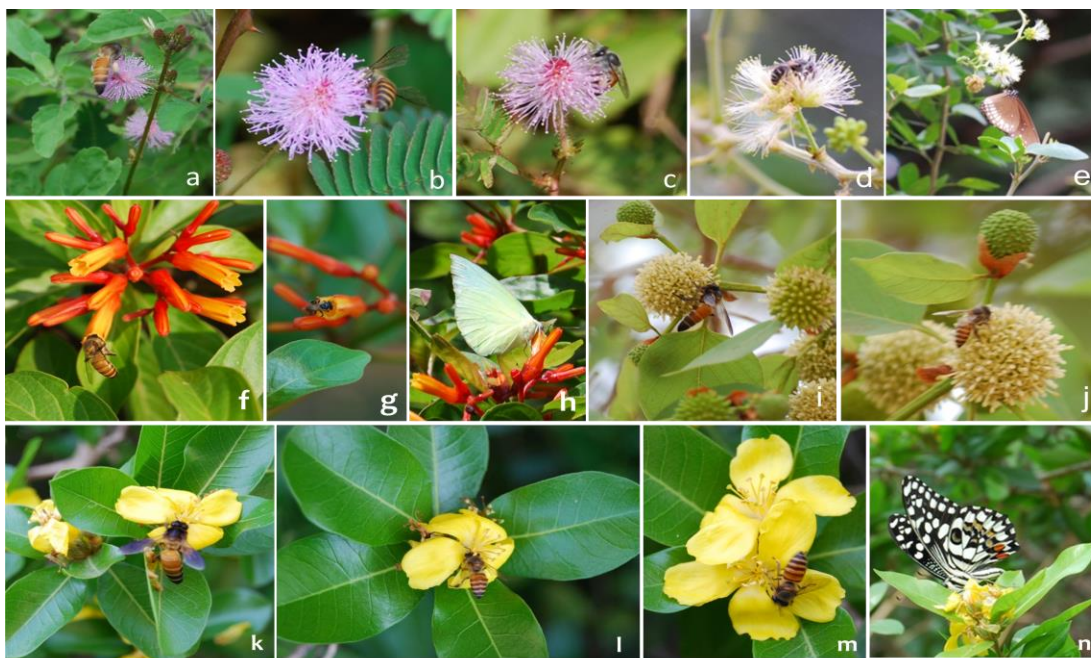
Figure 3. Mimosa pudica : a-c. -a. Apis dorsata collecting pollen, b. Apis cerana collecting pollen, c. Apis florea collecting pollen; d. & e. Pithecellobium dulce - d. Apis florea probing for nectar, e. Nymphalid butterfly, Euploea core ; f-h. Hamelia patens – f. Apis cerana collecting pollen, g. Trigona iridipennis collecting pollen, h. Pierid butterfly, Catopsilia pyranthe collecting nectar; i. & j. Mitragyna parvifolia – i. Apis dorsata collecting nectar, j. Apis cerana collecting nectar; k-n. Hugonia mystax - k. Apis dorsata collecting nectar, l. Apis cerana collecting nectar, m. Apis cerana collecting pollen, n. Papilionid butterfly, Papilio demoleus collecting nectar.

In both species, the bisexual and staminate flowers offer nectar and pollen as floral rewards to the visitors. The flowers visitors were exclusively honey bees, Apis dorsata (Figure 2i), A. cerana and A. florea . They visited the flowers throughout the day with intense activity during forenoon hours. Since nectar is secreted in traces, these bees concentrated mainly on pollen collection although it also collected nectar. As all the flowers of a raceme bloom synchronously on the same day, it is energetically profitable for the bees to collect huge amount of pollen along with nectar in single visit by reducing flying time and search time for the rewarding flowers.