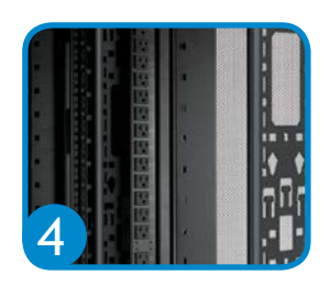
Rear Cable Channels