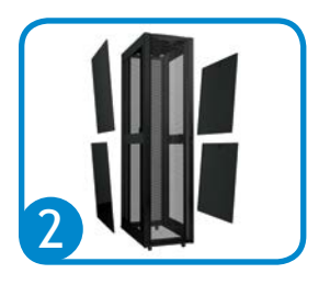
Half-Height Side Panels