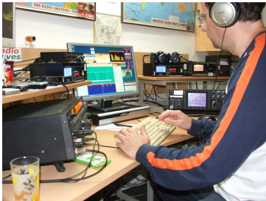
Top: YT3M P1 CW LP Bottom: LZ8E P2 CW LP