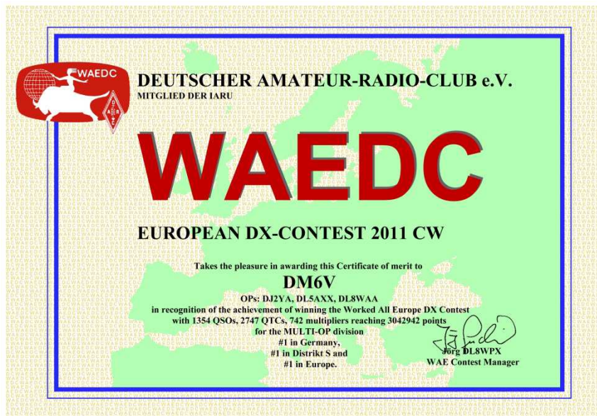
Certificate P1 Europe DM6V