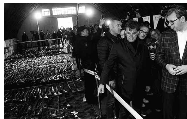
Serbian President Aleksandar Vucic (right) inspects weapons collected as part of an amnesty in Smederevo, Serbia.

Vucic said the approximately half of the weapons collected were illegal while the