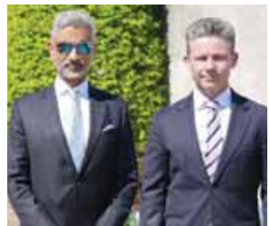
External Affairs Minister S Jaishankar meets Defence Minister of Sweden Pál Jonson during his visit to Sweden on Sunday

Addressing the EU-Indo Pacific Ministerial meeting at Stockholm, Jaishankar called on the leaders to consider six points, which include globalisation, Indo-Pacific and leveraging of market shares. On globalisation, he said, the EU