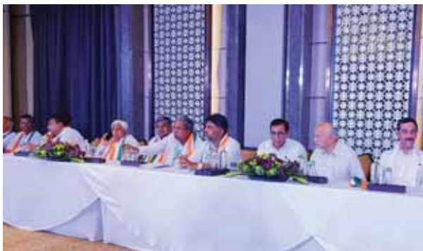
Senior Congress leaders Randeep Surjewala, KC Venugopal, Siddaramiah, DK Shivakumar and others during the Congress Legislature Party meeting, in Bengaluru, on Sunday

When Bhupesh Baghel was appointed the CM in 2018 then rival TS Singh Deo, who is a Cabinet Minister in Chhattisgarh, is believed to have been promised elevation to the CM's post after two-and-a-half-years but that did not happen and the State is now preparing for the term-end Assembly polls.