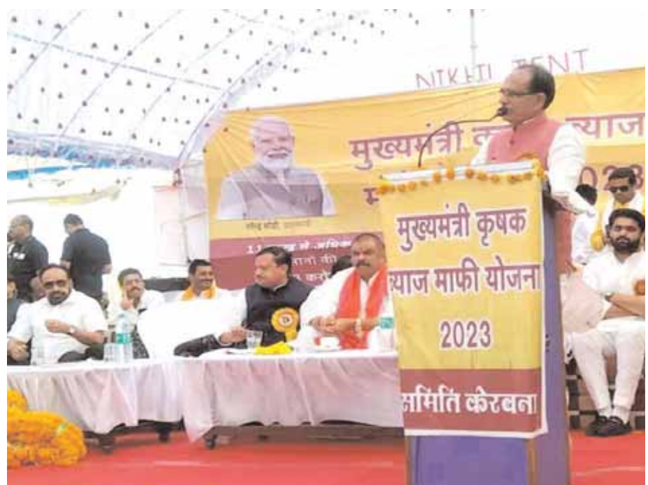
Madhya Pradesh Chief Minister Shivraj Singh Chouhan addressing a programme during inauguration of CM Farmers Loan Interest Waiver Scheme-2023 in Sagar district on Sunday.

Cooperative Minister Arvind Singh Bhadoria said that today is a historic day for the farmers of the state. The scheme for waiving the interest amount of farmers who defaulted due to the false announcement of loan waiver by the old government has been started in the state today. Under the scheme, interest of Rs 2200 crore will be waived off for about 11 lakh farmers of the state. With this, farmers will also be able to take advantage of the government's crop loan scheme at zero percent interest.