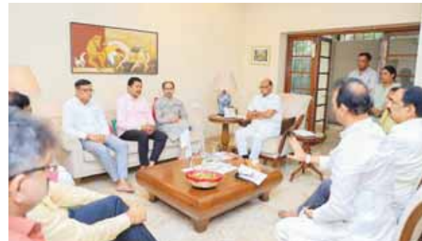
Maha Vikas Aghadi leaders Sharad Pawar, Uddhav Thackeray, Nana Patole, Balasaheb Thorat and others during a meeting at Pawar's residence, in Mumbai, on Sunday