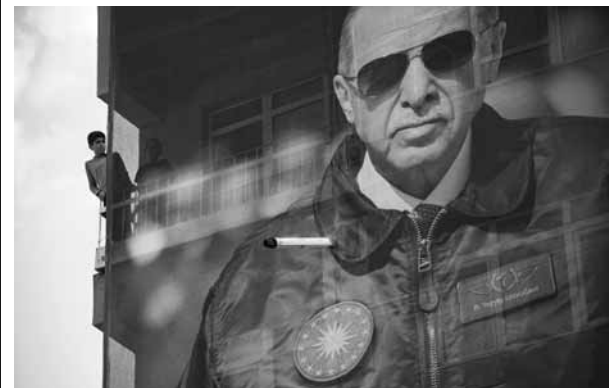
Youngsters stand next to giant election billboard of Turkish President and People's Alliance's presidential candidate Recep Tayyip Erdogan during a campaign rally in Istanbul, Turkey on Saturday.