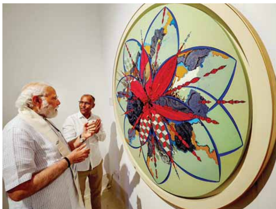
Prime Minister Narendra Modi visits 'Jana Shakti', an exhibition at the NGMA, in New Delhi, on Sunday. This exhibition contains works by India's top artists on themes covered in 'Mann Ki Baat' such as Swachhata, water conservation, agriculture, space, India's northeast, Nari Shakti and Yoga, and Ayurveda