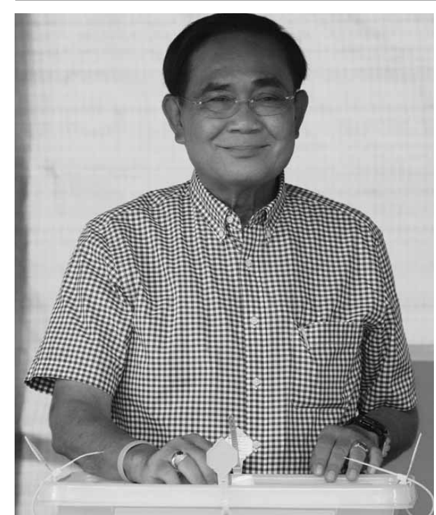
Thailand's Prime Minister Prayuth Chan-ocha poses as he casts his vote during a general election at a polling station in Bangkok, Thailand, on Sunday.