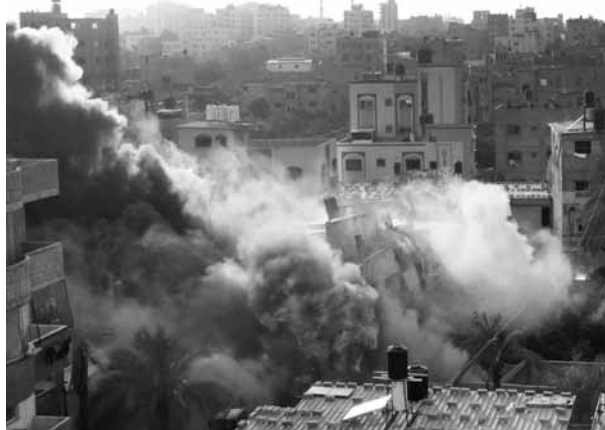
Smoke rise from an explosion caused by an Israeli airstrike targeting a building in Gaza on Saturday. The building was owned by an Islamic Jihad official.

and much farther than Gaza know that even if they try to hide, we are able and prepared to reach them at any time," he told a meeting of his Cabinet.