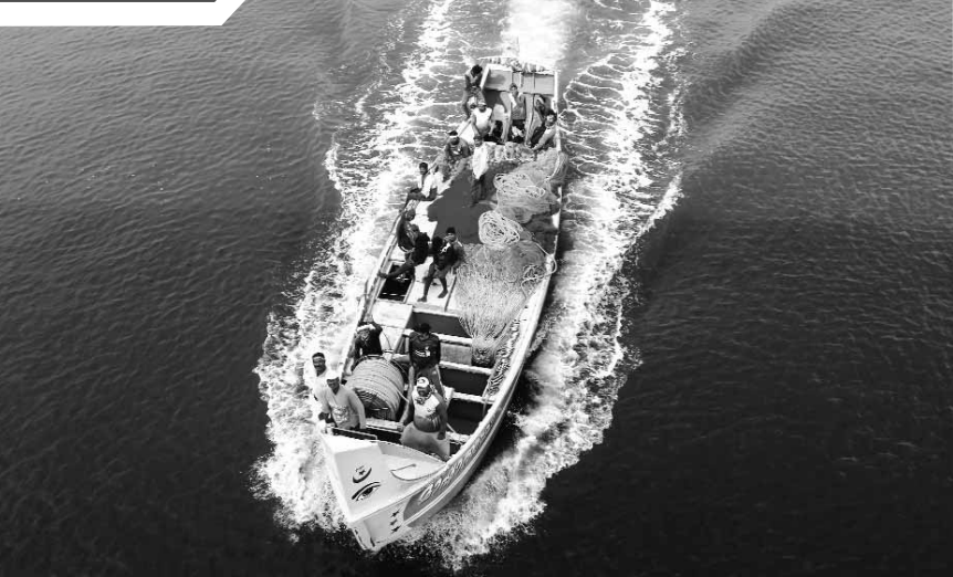
Fishermen return after encountering rough sea owing to Cyclone Mocha, in Thiruvananthapuram