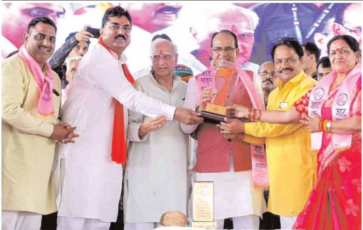
Madhya Pradesh Chief Minister Shivraj Singh Chouhan during a Jat Mahasabha at BHEL Dussehra Ground in Bhopal on Sunday.

The government has also done many things in the direction of the upliftment of women.