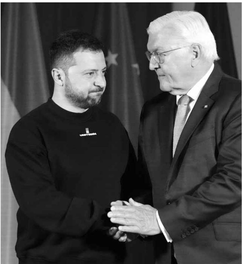
Germany's President Frank-Walter Steinmeier, right, greets Ukraine's President Volodymyr Zelenskyy at Bellevue Palace in Berlin, Germany on Sunday.