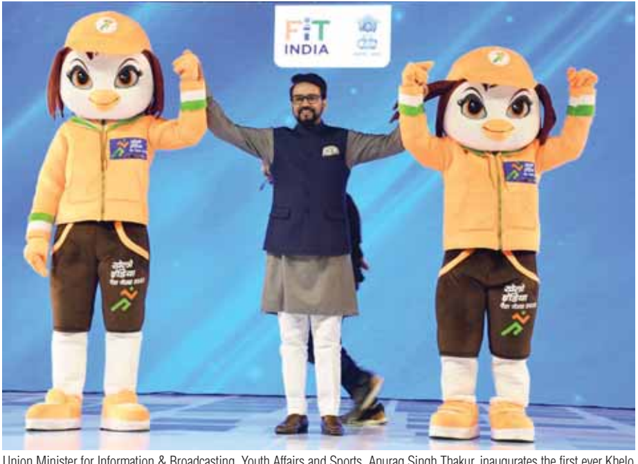
Union Minister for Information & Broadcasting, Youth Affairs and Sports, Anurag Singh Thakur, inaugurates the first ever Khelo India Para Games, in New Delhi, on Monday.

some doubts regarding Michel's team after it failed in its first big test - a 3-0 loss at home to Real Madrid in September. But that was Girona's only defeat of the season. Its other setbacks were a draw at fifth-place Real Sociedad in its league opener and a home draw against sixth-place Athletic Bilbao last month. "We'll see what happens," said Girona defender Miguel Gutierrez, who scored one of the goals on Sunday. "We are in the lead and we will keep fighting to stay in the lead. We have been doing things well and we need to continue like this." BARCELONA'S REALITY Xavi said it was an even match against Barcelona's Catalan rival but the loss represented a step backward in the club's rebuilding process. "It's our reality," he said. "This is a Barcelona team that is being rebuilt. And this is part of it. You take a step backward to be able to take two steps forward." Barcelona next visits Valencia in the Spanish league, while Girona hosts Alaves. Barcelona visits Antwerp in the Champions League on Wednesday. It has already secured a place in the knockout stage, something it had failed to do in the last two seasons.