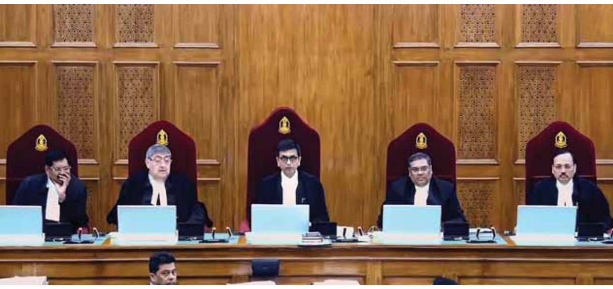
The five-judge bench comprising Chief Justice DY Chandrachud and Justices Sanjay Kishan Kaul, Sanjiv Khanna, BR Gavai and Surya Kant during pronouncement of verdict on a batch of petitions challenging the abrogation of Article 370 of the Constitution, in New Delhi, on Monday