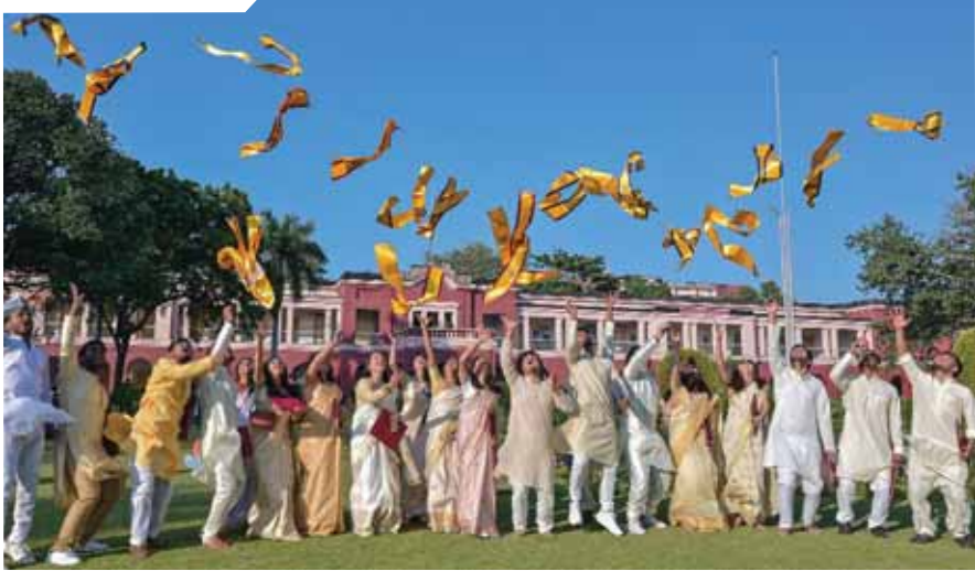
Students in jubilant mood after receiving their degree on 98th Foundation Day celebration of IIT in Dhanbad