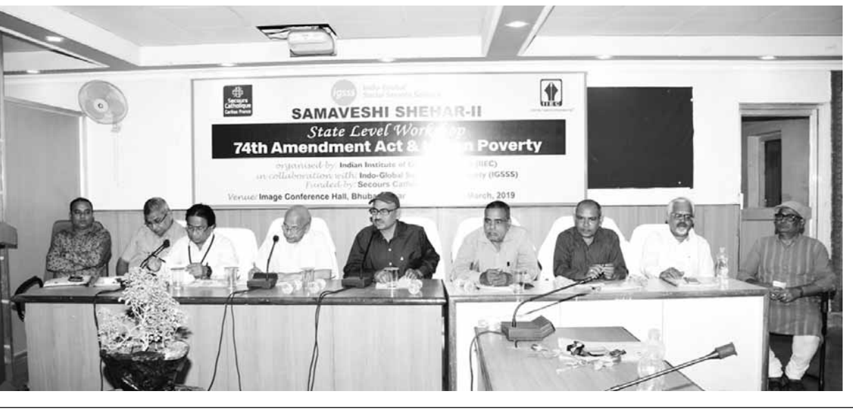
SAMAVESHI SHEHAR-II State Level Workshop on 74th Amendment Act & Urban Poverty. Organized by IIEC in collaboration with Indo-Global Social Service Society (IGSSS) and Secours Catholique Caritas France. Venue: Image Conference Hall, Bhubaneswar. Date: March 27, 2019.