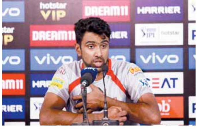
R Ashwin speaks during a press conference

in the 13th over, an action popularly known as 'Mankading'. TV replays showed that Ashwin had waited for Buttler to move out of the crease before removing the bails. "Look it was very instinctive. It wasn't planned or anything like that. It's there within the rules of the game. I don't know from where the understanding of the Spirit of the Game comes," Ashwin said at the post-match press conference. The mode of dismissal is permissible as per ICC Rule 41.16 of playing conditions, according to which there is no need to warn the batsman as was the case in earlier times.