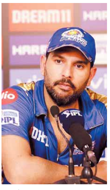
Yuvraj Singh speaks during a press conference