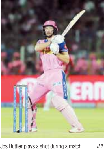
Jos Buttler plays a shot during a match

LAST YEAR'S MATCHES • Kolkata Knight Riders defeated Kings XI Punjab by 31 runs at Indore • Kings XI Punjab beat Kolkata Knight Riders by 9 wickets (D/L) at Kolkata FOR THE RECORD • Sunil Narine will become the 38th player to complete a century of matches in IPL. He played all matches for Kolkata Knight Riders since 2012. Gautam Gambhir (108) and Yusuf Pathan also played over 100 matches for Kolkata Knight Riders between 2011 and 2017. • Chris Gayle who hit 296 sixes in 112 innings of 113 matches, needs just four sixes to become the first batsman to smash 300 sixes in IPL. Faisal Features