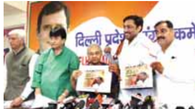
(Nyay) announcement as an "extraordinary step", Sheila said this is the biggest scheme announced ever for the poor after the highly successful MGNREGA (Mahatma Gandhi National Rural

Employment Guarantee Act). "This stupendous scheme will benefit the people below the poverty line in the country. It is the first time that such a step has been taken in the world," said Sheila, adding that it will empower the poorest in the country. Hitting out at the Bharatiya Janta Party (BJP), Sheila said it is strange that the BJP Government which has coined "hollow" slogans such as "Sabka Saath, Sabka Vikas" and "Aachhe Din" seems to be rattled by the announcement. Sheila said the Congress will implement the scheme for five crore