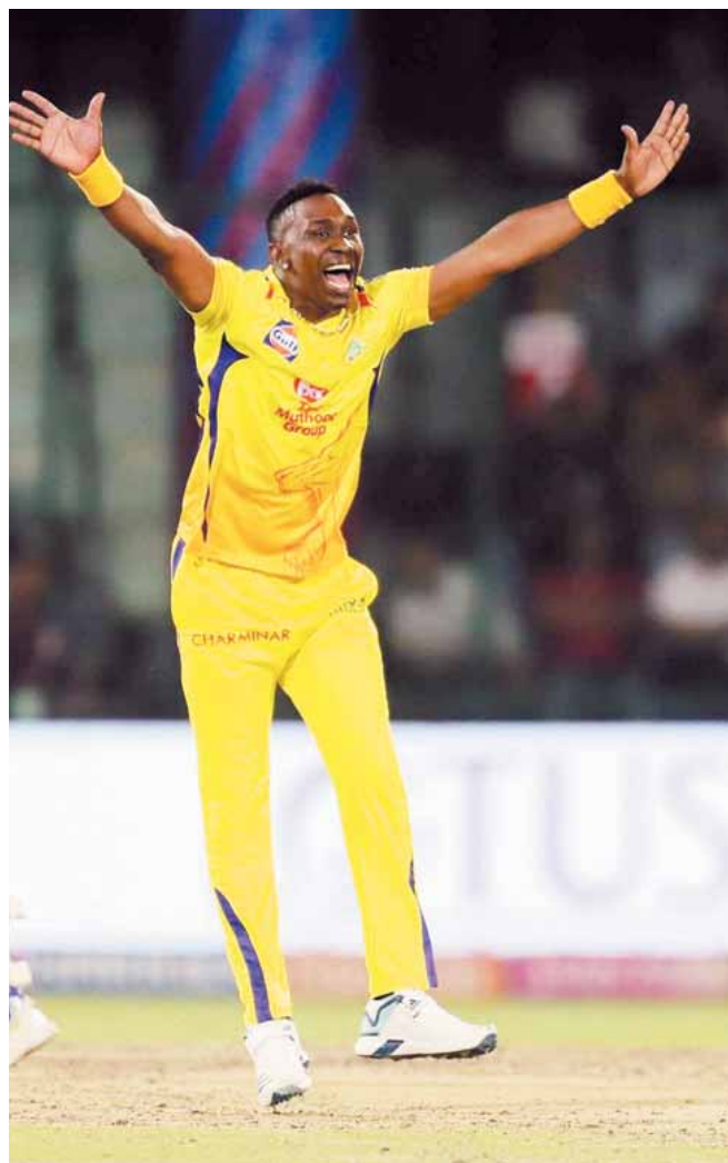
Shikhar Dhawan (Delhi Capitals) plays a shot while Mahendra Singh Dhoni (Chennai Super Kings) stand behind the wickets, (right) Dwayne Bravo celebrates after taking a wicket

PTI ■ NEW DELHI Shikhar Dhawan scored a painstaking half-century in Delhi Capitals' sub-par 147 for 6 against Chennai Super Kings on a lifeless Kotla track in an IPL encounter here on Tuesday. The senior opener once again played the role of sheet anchor in his 51 off 47 balls that had seven boundaries but unfortunately failed to accelerate during the final overs. This left the home team at least 30 runs short of a fighting score. From a comfortable 120 for 2