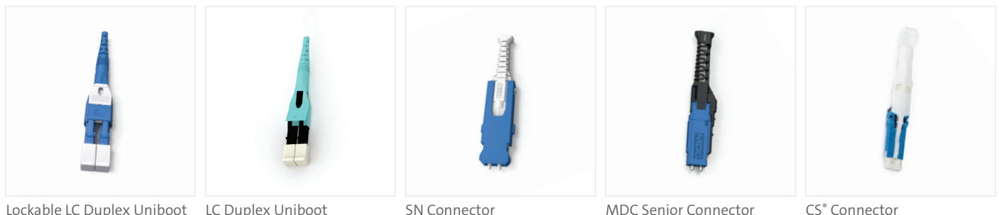
Lockable LC Duplex Uniboot