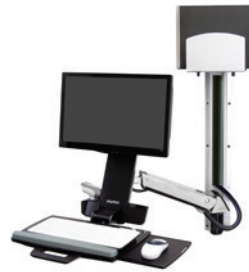
StyleView Sit-Stand Combo System Combo System with work surface: 45-270-026 Combo Arm, medium CPU holder and wall track, polished aluminum 45-272-026 Combo Arm, small CPU holder and wall track, polished aluminum Combo System: 45-271-026 Combo Arm, medium CPU holder and wall track, polished aluminum 45-273-026 Combo Arm, small CPU holder and wall track, polished aluminum