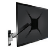
Interactive Arm HD 45-296-026 polished aluminum VHD 45-304-026 polished aluminum