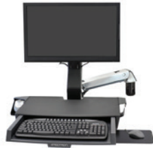
StyleView Sit-Stand Combo Arm Combo Arm with work surface: 45-260-026 polished aluminum Combo Arm: 45-266-026 black head-assembly only, polished aluminum Extender Arm: 45-261-026 polished aluminum