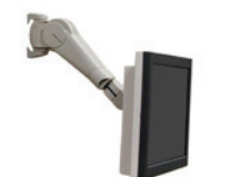
400 Series Wall Mount LCD Arm 45-007-099 grey 45-007-085 black