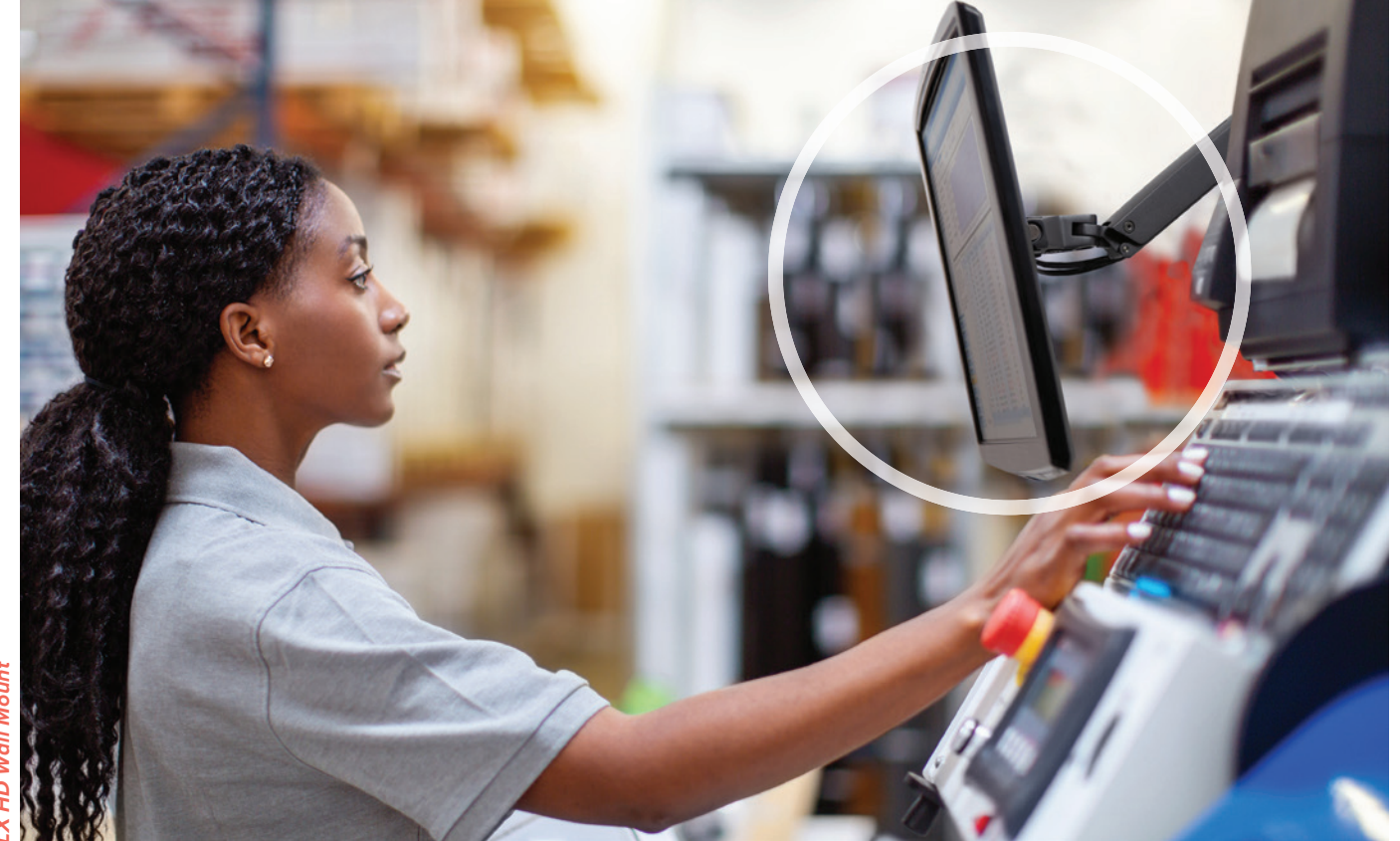
LX HD Wall Mount