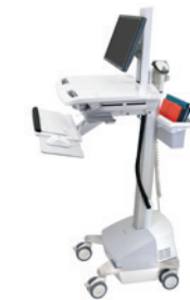
StyleView™ 42 Series LCD pivot version shown Powered with SLA or LiFe battery