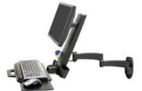
200 Series Combo Arm 45-230-216 white 45-230-200 black