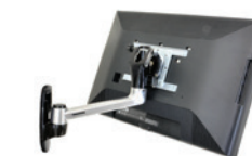
LX HD Wall Mount Swing Arm 45-268-026 polished aluminum Pivot 45-269-009 black