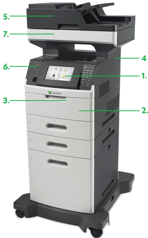
XM5163 model with 550-sheet tray, 2100 sheet tray and caster base