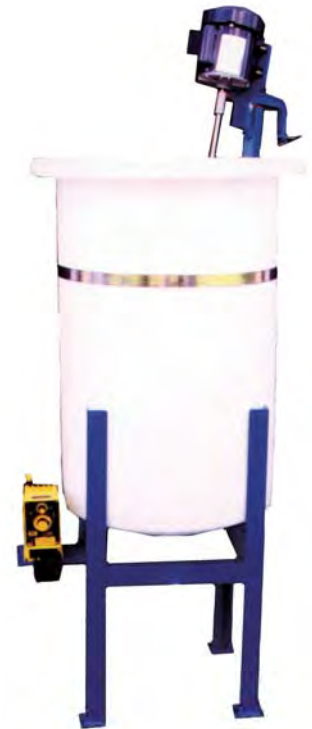
55 Gallon cone bottom tank with custom stand, mixer bracket, 3/4 H.P. mixer, & chemical feed pump