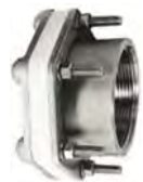
316 SS Bolted Fitting