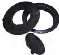
8" Lid With Ring and Vent