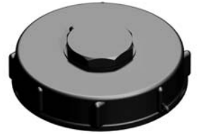
Part # - T9670CCS