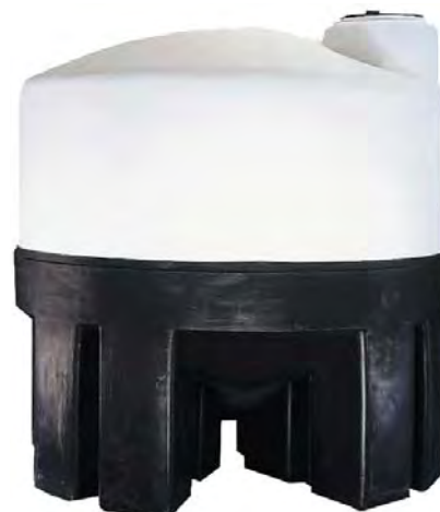
Cone bottom tank with polyethylene stand.

Items in red include Polyethylene stand.