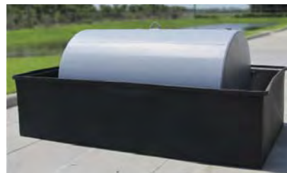
500 gallon fuel tank shown in T6124D containment basin

Carbon Steel Fuel Tanks Available in 3 popular sizes, 280 Gallon, 500 Gallon and 1000 Gallon. Available in Single wall and Double wall, Also available with or without UL Label. All Carbon Steel Fuel tanks include Roll Over Brackets.