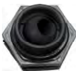
Self-Aligning PVC Fitting