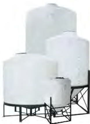
Cone bottom tanks with steel stands.

Steel stands can be modified to suit custom applications.