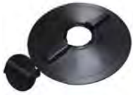
16" Lid With Vent