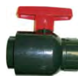
PVC Ball Valve