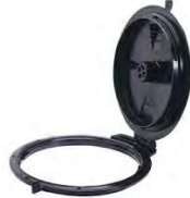
16" Hinged Lid with Ring and Vent