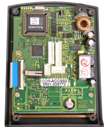
Back of Unit Cover Off

The COR-ACC950 proximity card reader is an advanced access control device in a weather-proof case that uses an LCD panel and LEDs to provide users with a visual indication that a card has been successful scanned. A beeper provides audio feedback. It can operate in network or standalone mode ( detects mode automatically). Control mode, card capacity and card type are assignable by user directly. Maximum distance is approx. 18 cm (7 inches), depending on weather conditions and setup. Constructed of tough ABS plastic and sealed against the weather.