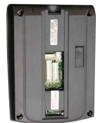
Back of Unit Cover On