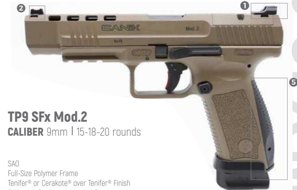
TP9 SFX Mod.2 CALIBER 9mm | 15-18-20 rounds

SAO Full-Size Polymer Frame Tenifer® or Cerakote® over Tenifer® Finish Corrosion Resistant Internal Coating Mec-Gar® Magazines