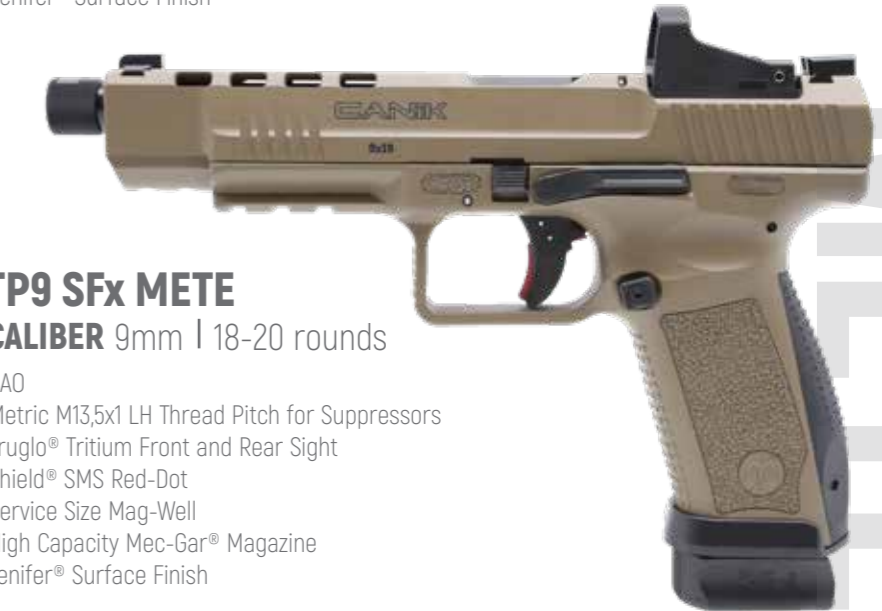
TP9 SFx METE CALIBER 9mm | 18-20 rounds