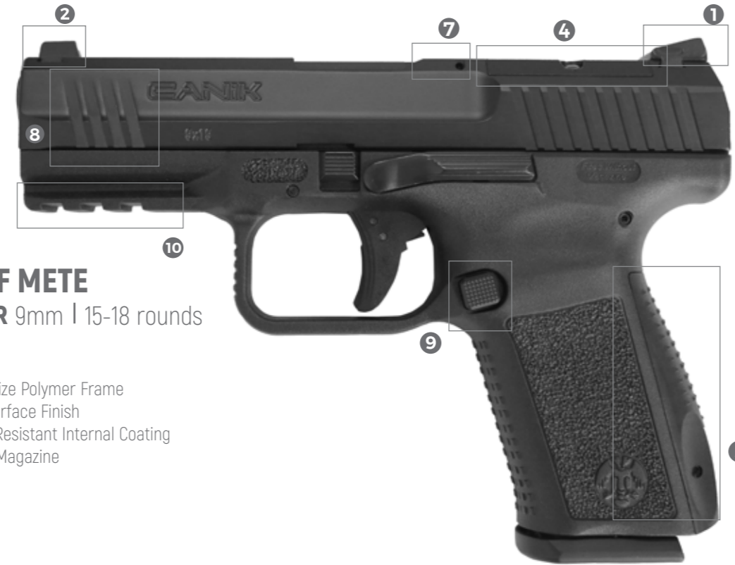
TP9 SF METE CALIBER 9mm | 15-18 rounds