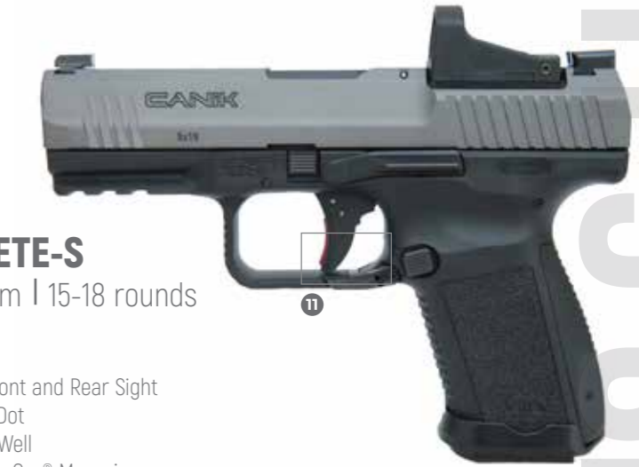
TP9 SF METE-S CALIBER 9mm | 15-18 rounds