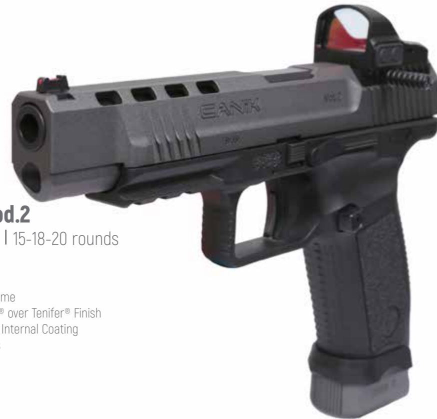
TP9 SFX Mod.2 CALIBER 9mm | 15-18-20 rounds

SAO Full-Size Polymer Frame Tenifer® or Cerakote® over Tenifer® Finish Corrosion Resistant Internal Coating Mec-Gar® Magazines