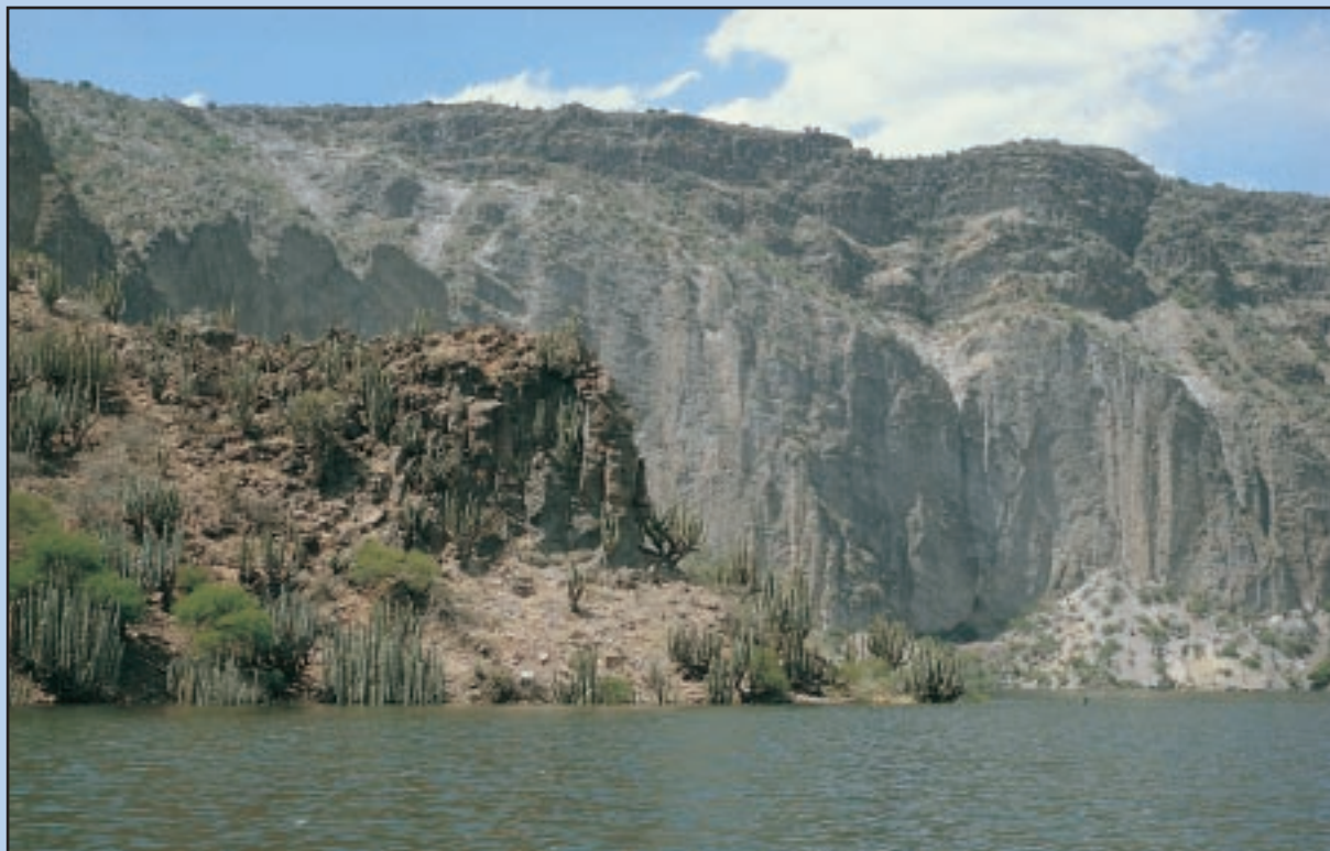
Figure 5 Numerous cacti drowning in the rising water-level of the man-made lake

even existence of these plants is unknown. A few specimens are to be found in a couple of research collections in Mexico and I have heard that plants have recently been offered commercially in Europe. Its continued existence in habitat depends on replanting conserved plants in a suitable environment in another canyon or, in the unlikely event of the present dam ceasing to function, restoring it to its original site.