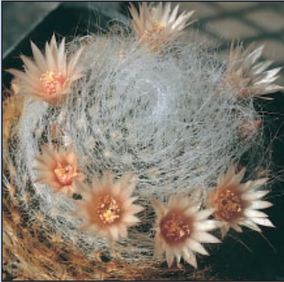
Figure 3 Mammillaria (crinita subsp.) scheinvariana in the collection at CANTE in San Miguel Allende

described. This was due to some uncertainty as to the identity of the plant. Some of the populations included plants with hooked central spines while others did not. It was eventually concluded that the plants with