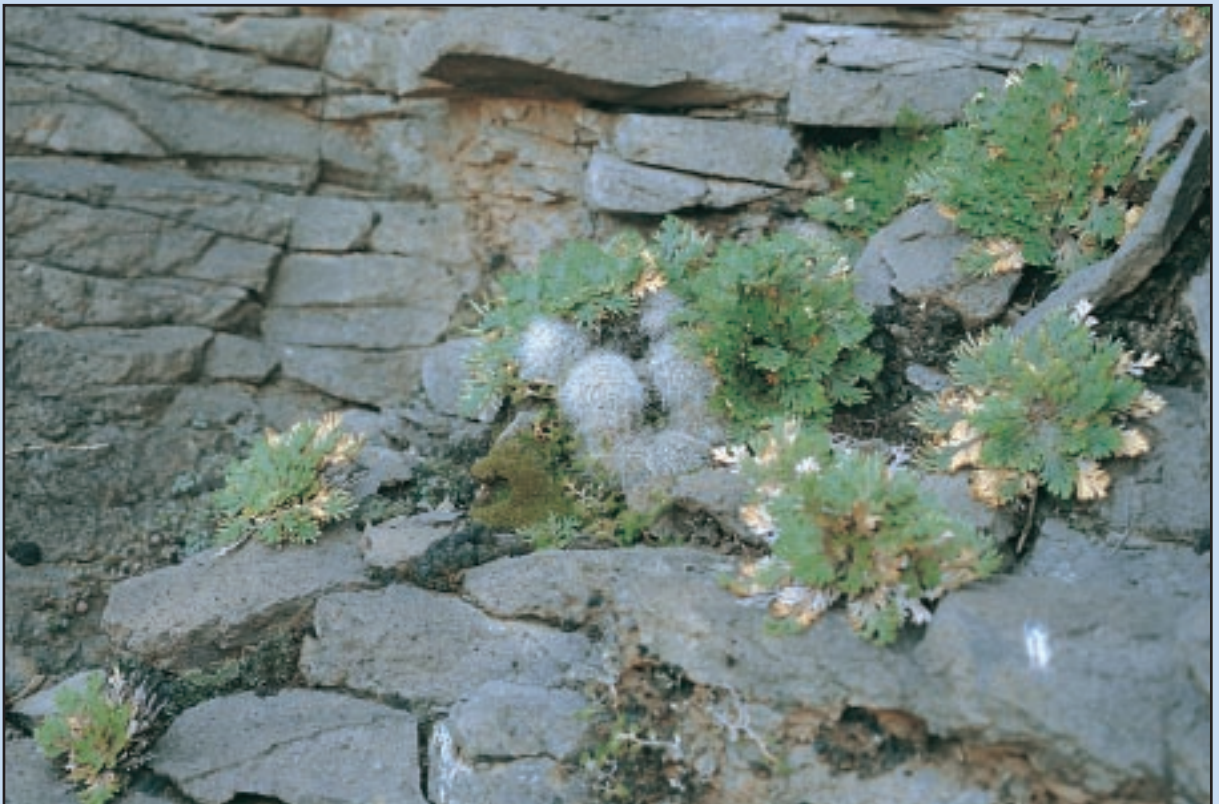
Figure 4 A clump of Mammillaria (crinita subsp.) scheinvariana growing on the rocks, just above the rising water-level

Now that the level of the water in the lake has reached its maximum height, all the known sites for the plant are submerged and, unless further populations are discovered, it must be considered extinct in the wild. Since this state of affairs was anticipated well in advance, plants were collected and taken to the CANTE Botanical Garden and propagated. In the following year or so I saw many young plants in their propagating facility. However, as is well known, it was not possible to export these plants. With the demise of the CANTE organisation the present whereabouts or