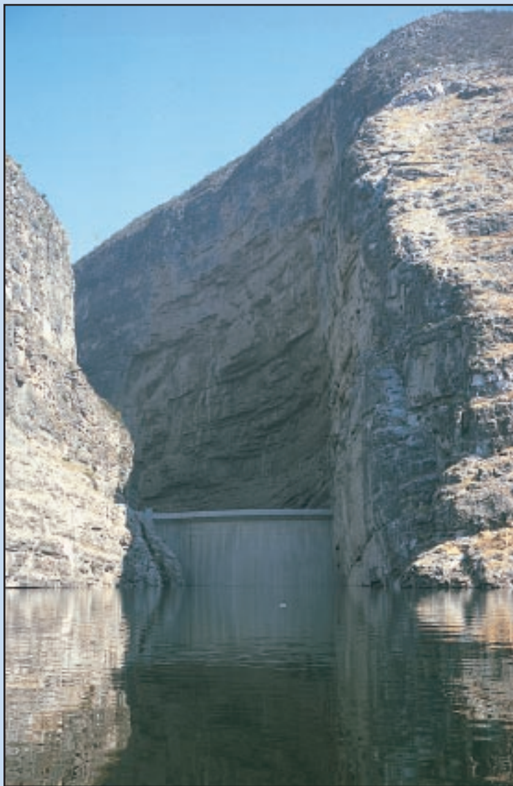
Figure 2 The wall of the dam, the "presa de Zimapan"

M. scheinvariana had already been discovered at this time but had not yet been