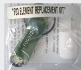
Filter Kit Order Number F00E900361