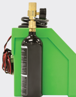
Inert Gas Pack Order Number F00E900355