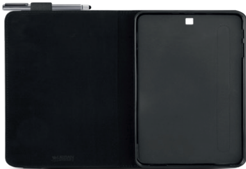
Porte Stylét Pencil Holder