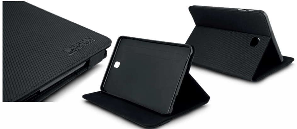
Matière extérieure déperlante Water drop outside fabric