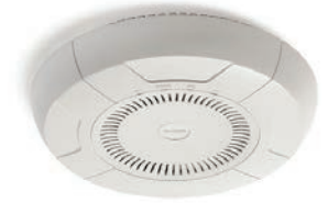
9100 Series Family

The WLAN 9100 Series uses next-generation wireless to provide predictable performance. The Series offers common advanced feature set including integrated controller, application control, zero-touch provisioning and On-Premise or Cloud Management. The WLAN 9100 Series offers flexible deployment options for spectrum optimization, ease of deployment using its Cloud offering an Avaya Fabric while providing device fingerprinting, roaming assist, Bonjour support and secure network access.