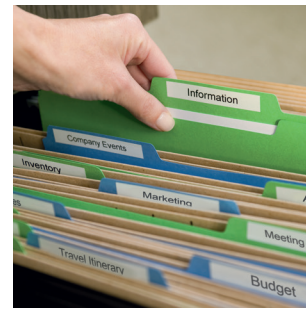
Files and folders