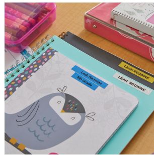
Crafts & Creative