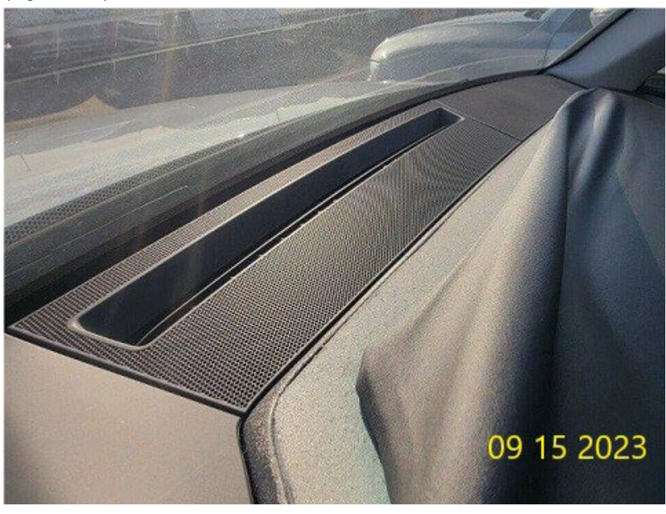
Figure 1. Massive, large-scale delamination.

The following six photos show defect patterns that may be claimed under this TSB/Warranty Extension (Figures 1-6).