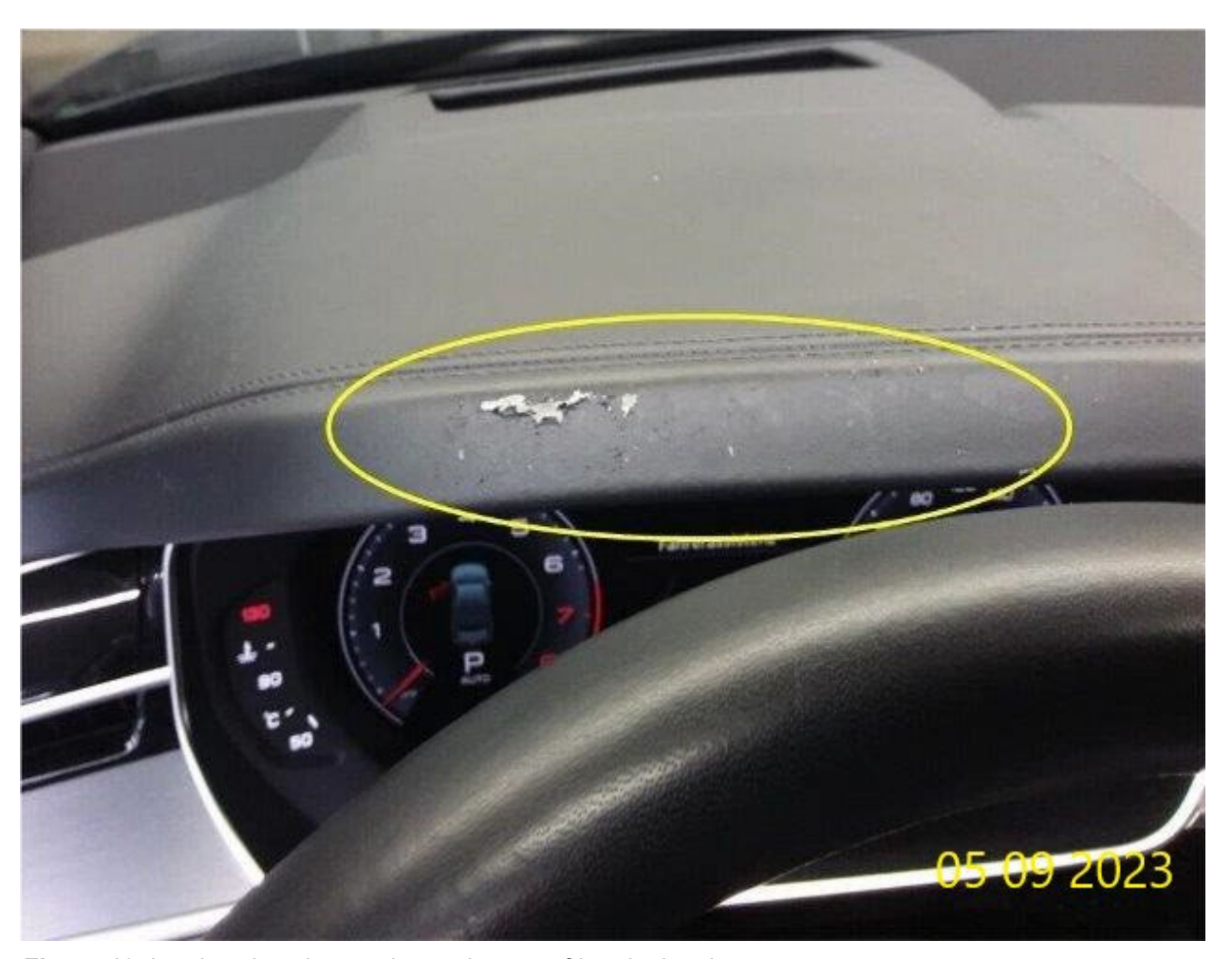
Figure 10. Leather detachment due to the use of harsh cleaning agents.