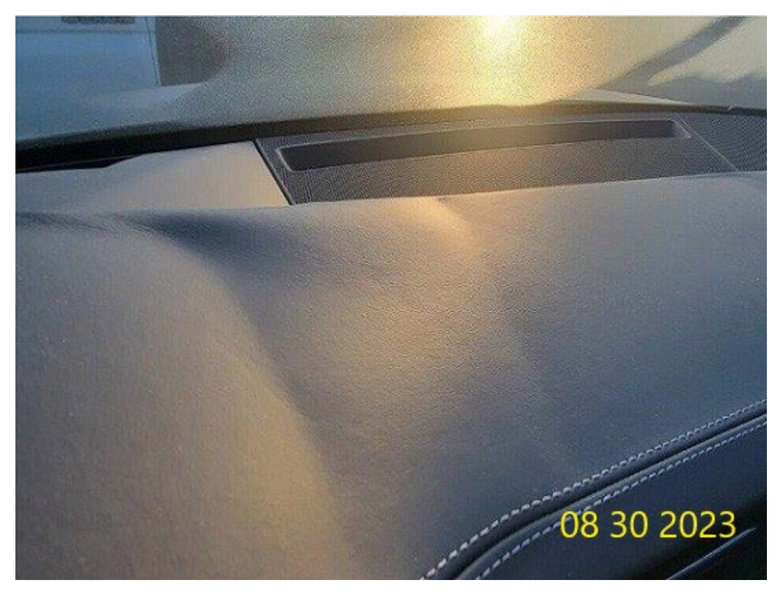
Figure 2. Massive, large-scale delamination.