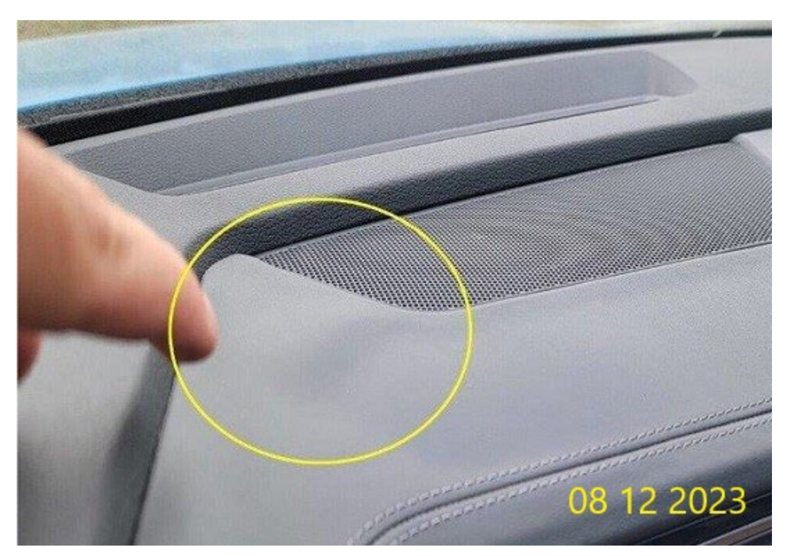
Figure 5. Slight blistering / bubbling.