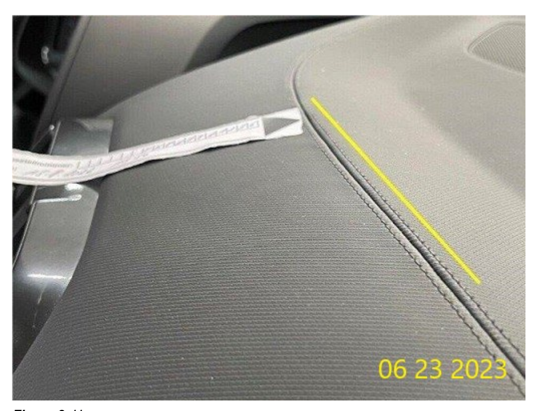
Figure 8. Uneven seam.

The following three photos show damage patterns caused by outside influences. These are not warrantable defects and cannot be claimed under Warranty (Figures 9-11).