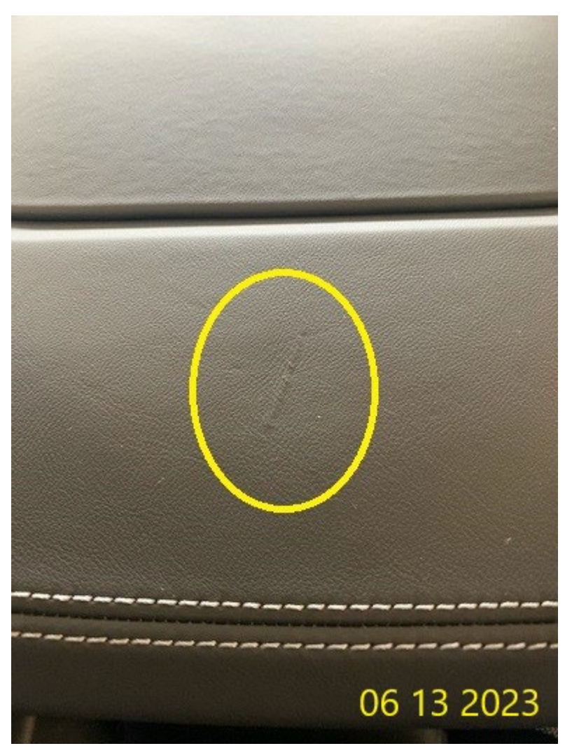
Figure 11. Leather surface scratched.