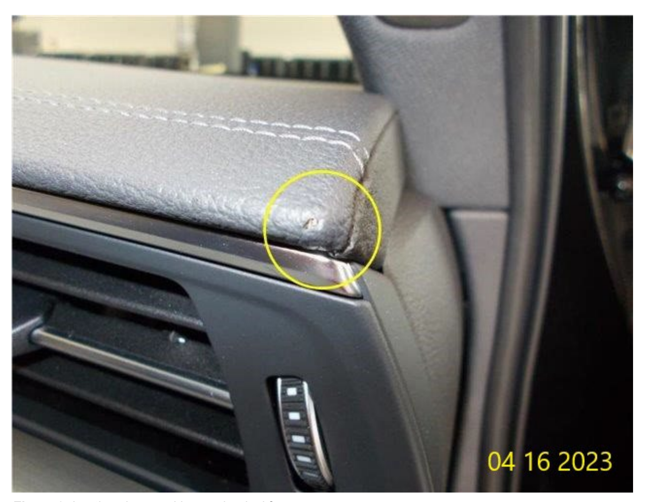
Figure 9. Leather damaged by mechanical force.