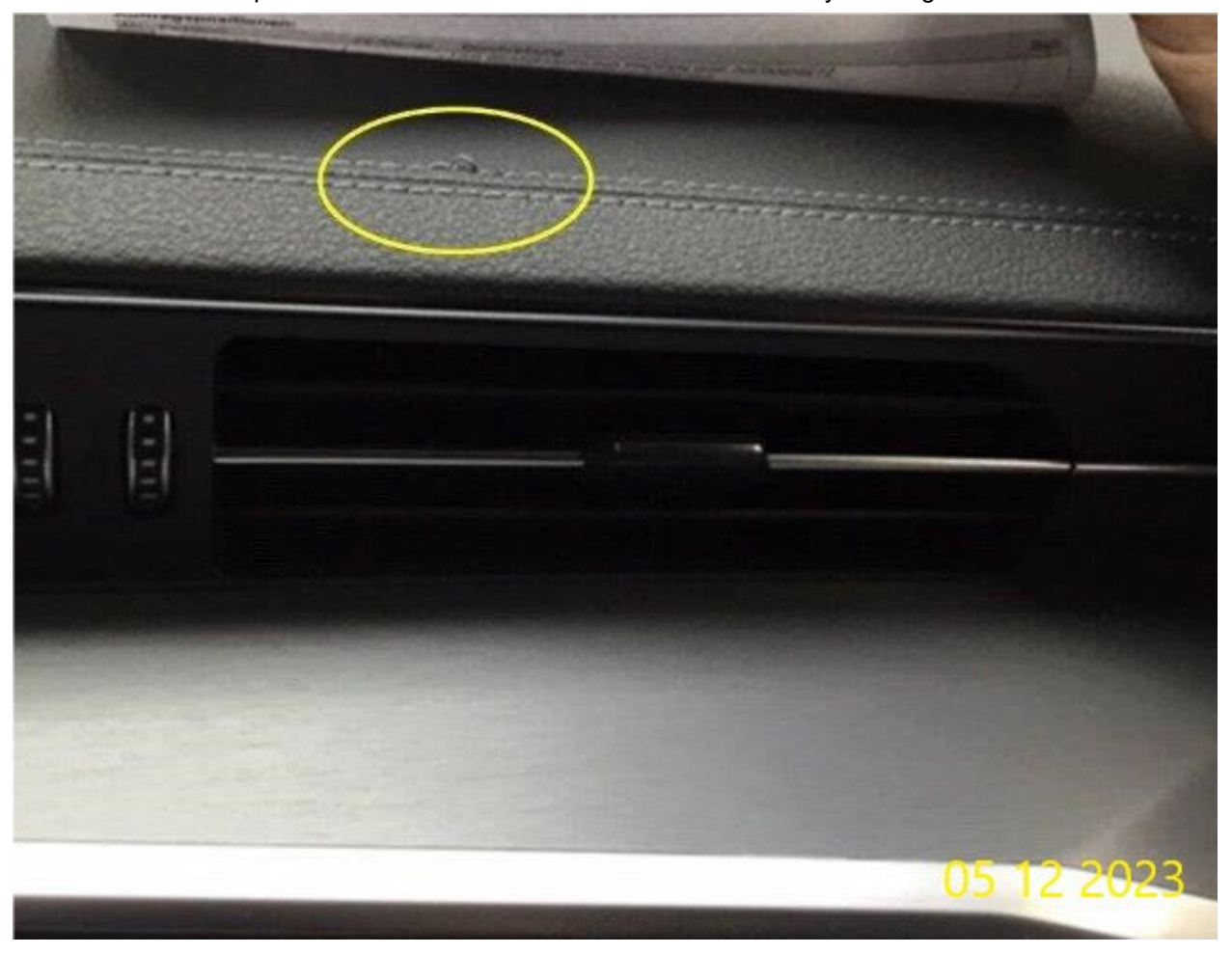
Figure 7. Stitching defect.

These customer complaints are covered under the "Trim items" warranty coverage.