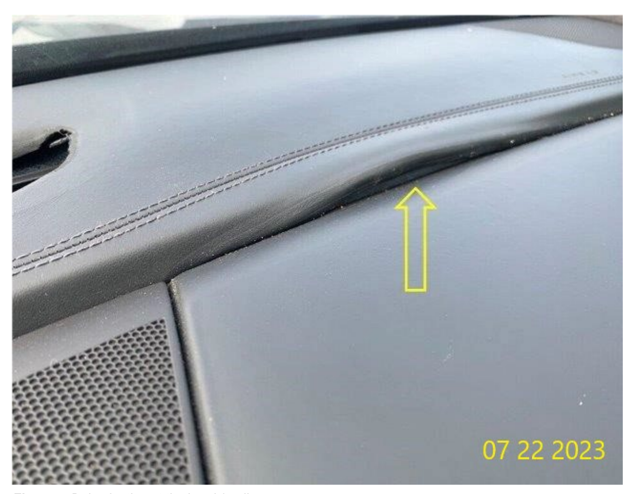
Figure 4. Delamination at the bend / radius.