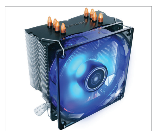
Quiet, 120 mm LED PWM fan with 77 CFM of airflow illuminates your rig with blue light