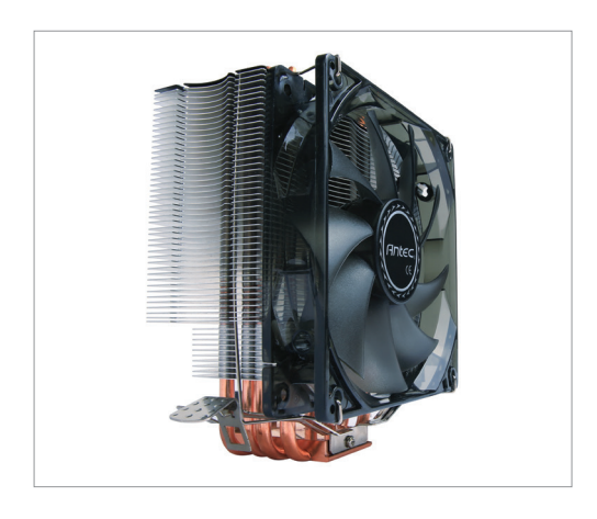
Compatibility with the newest Intel and AMD platforms, and the push-pin mounting system and included gold thermal paste make for a fast, simple installation