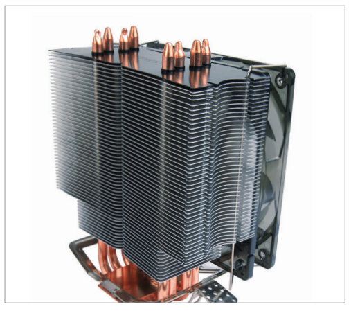
Two-tiered fin structure dissipates heat efficiently, while aluminum oxide coating prevents oxidation