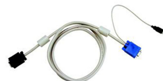
CB-6 USB Hub KVM ONLY