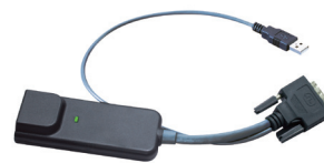
DG - 100SD Cat6 Dongle