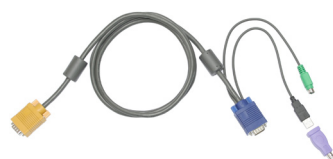
CE-6 Combo KVM