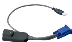
DG - 100S Cat6 Dongle