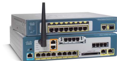
Figure 2. Cisco Unified Communications 520 Series: 24- and 32-User Configuration