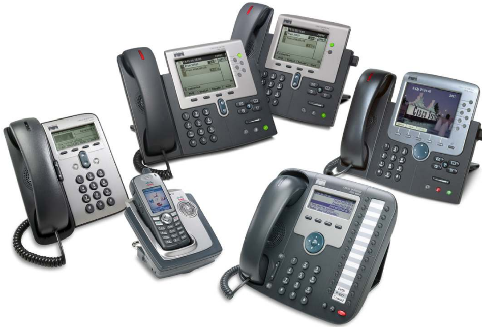
Figure 4. Cisco Unified IP Phone Portfolio

The Cisco Unified IP Phone portfolio includes options for use from wherever you are: the company lobby, the manufacturing floor, the executive suite, at home, on the road, or in a branch office (Figure 4).