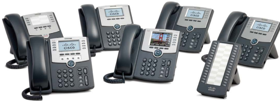
Figure 6. Cisco SPA 500 Series IP Phones

Part of the Cisco Small Business Pro Series; The Cisco SPA 500 Series IP Phones (Figure 6) are a robust portfolio of small business phones that provide a rich user experience with Cisco wide band audio support, XML applications, and intuitive menu options. Intended for use with the Cisco Smart Business Communications System and Cisco SPA9000 Voice System applications, or SIP based open source or hosted IP telephony solutions.