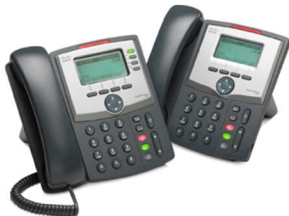
Figure 5. Cisco Unified IP Phones 500 Series

The Cisco Unified IP Phones 521G, 521SG, 524G, and 524SG (Figure 5) are a set of entry-level IP phones that provide key system type capabilities, built specifically for use with Cisco's Unified Communications 500 Series platforms. These phones can be used to handle low to moderate telephone traffic. The Cisco Unified IP Phones 521G and 521SG are single-line IP phones being able to handle up to two active calls. The Cisco Unified IP Phones 524G and 524SG provides 4 programmable line or feature buttons with each line being able to handle up to two active calls. Four dynamic soft keys on each phone guide you through core business features and functions, while a back-lit monochrome pixel-based display combines intuitive features, calling information, and device system information. The Cisco Unified IP Phones 521G, 521SG, 524G, and 524SG offer IEEE 802.3af PoE, or local power through an optional power adapter.