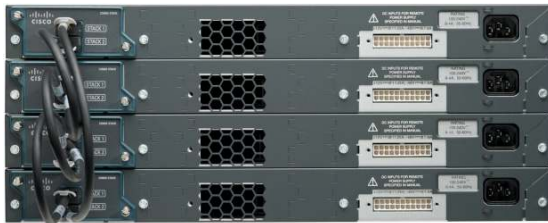
Figure 3. Cisco Catalyst 2960-S Switches with Cisco FlexStack Modules and Stack Cabling

Cisco FlexStack stacking with a hot-swappable module and Cisco IOS ® Software provides true stacking, all switches in a stack act as a single switch unit. The Cisco FlexStack provides a unified data plane, unified configuration, and single IP address management for a group of switches. The advantages of true stacking are lower total cost of ownership through simplified management and higher availability. Cisco FlexStack supports cross-stack features including EtherChannel, SPAN and FlexLink technology. A stack module can be added to any Cisco Catalyst 2960-S switch with LAN Base software to quickly upgrade the switch to make it stack capable, and the switch added to the stack will upgrade to the correct Cisco IOS ® Software version and transparently become a stack member. Figure 3 shows the FlexStack stacking module for the Cisco Catalyst 2960-S.