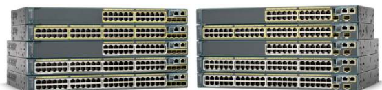
Figure 1. Cisco Catalyst 2960-S Series Switches