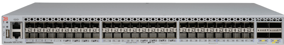
Figure 1: The Brocade VDX 6740 Switch provides 48 10 GbE SFP+ ports and four 40 GbE QSFP+ ports.

Additionally, Brocade VDX switches offer programmability and interoperability options through a PyNOS Library and YANG model-based REST and Netconf APIs. Cloud orchestration and control through OpenStack and OpenDaylight-based SDN controller support enable full network integration with compute and storage resource provisioning and management.