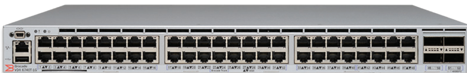
Figure 3: The Brocade VDX 6740T-1G Switch provides 48 1000BASE-T/10GBASE-T ports and four 40 GbE QSFP+ ports.