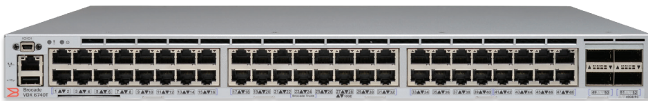
Figure 2: The Brocade VDX 6740T Switch provides 48 1000BASE-T/10GBASE-T ports and four 40 GbE QSFP+ ports.