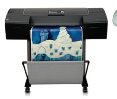
HP Designjet Z3100 GP 610 mm Photo Printer (Q5669B)

Base model plus 610 mm capabilities and the HP Advanced Profiling Solution Q6695A included in the box