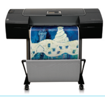
HP Designjet Z3100 610 mm Photo Printer (Q5669A)