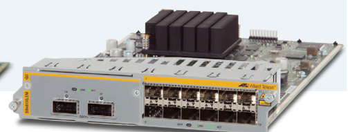
SBx81XLEM with Q2 module