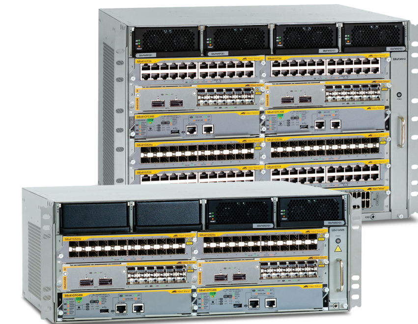
Power cords are only shipped with AT-SBxPWRSYS2 or AT-SBxPWRPOE1 power supplies. Note: Power entry connector is IEC 60320 C19 (High capacity)