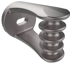
Multi-Drop Thimble Eye (ordered separately)

Available with AFL's Multi-Drop Thimble Eye (second photo) which is used to anchor aerial round drop cables to the distribution structure. The Thimble Eye has uniform radial slots that can accommodate up to four formed wire dead ends per thimble eye and support tensioning up to 90 degrees from the installation hardware.