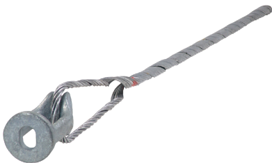
Drop Dead End shown with Single-Drop Thimble Eye

For more information on the optional Multi-Drop Thimble Eye (ordered separately), see specification sheet .