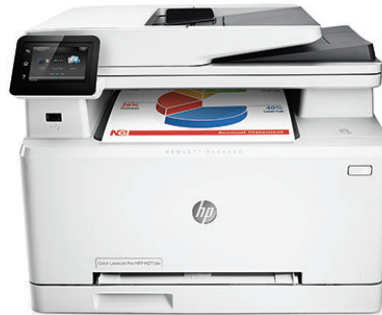
HP Color LaserJet Pro MFP M277dw

You'd never expect this much performance from such a small package. This loaded MFP and Original HP Toner cartridges with JetIntelligence combine to give you the tools you need to get the job done.