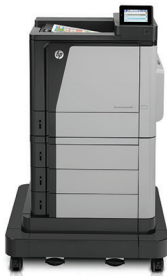
HP Color LaserJet Enterprise M651xh Printer