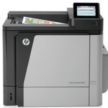
HP Color LaserJet Enterprise M651dn Printer

Performance you can count on: high-volume, professional-quality, two-sided colour documents with outstanding reliability. Efficient one-touch printing and mobile printing options plus simple management help you be productive wherever work takes you.