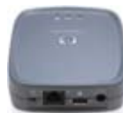
HP Jetdirect wireless external print server

Increase efficiency and security by installing the HP Jetdirect 635n IPv6/IPsec and Gigabit Ethernet internal print server in the available EIO slot.