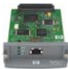
HP Jetdirect internal print server

Print professional documents and save time with the automatic two-sided printing unit (standard on the 5200dtn model).