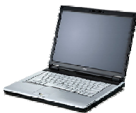
LIFEBOOK E Series

The LIFEBOOK S Series gives professional users the optimum combination of performance, modularity and flexibility: the functionality and ease of use of a desktop in a slimline, lightweight package. The integrated modem, network adapter, optional Bluetooth and wireless LAN are complemented by a multifunctional bay. The latest Intel Core 2Duo technology provide you long battery life away from the power socket.