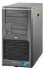
PRIMERGY TX100 S1

Always something new in the Peripherals Portfolio: e.g. keyboards and wireless sets in glossy piano black design fitting perfectly to the new lifestyle displays. Accessories and Security Devices according to latest technologies meet the latest market needs.