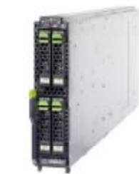
PRIMERGY SX940 S1

This storage blade for PRIMERGY BX600 offers an easy and cost effective opportunity for server consolidation. Rack and tower servers with high capacity of local hard disks are operating primarily in the area of small and medium enterprises. Very often it is essential having local access on large amounts of data; this for example applies to the wide area of Computer Aided Engineering (CAE), where smaller workgroups locally have to work on and create very large models. Operation within confined environments as file servers as well as for Microsoft SharePoint Servers and Microsoft SQL Servers are popular usage cases.