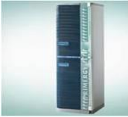
PRIMERGY BladeFrame BF400 S2

PRIMERGY BladeFrame is the platform to set up an application-independent and service-oriented IT infrastructure. The Processing Area Network (PAN) combines stateless servers (pBlades) with unique virtualization and management software, thus reducing the existing infrastructure complexity and providing a dynamic, high-availability system.