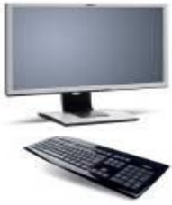
Displays & Peripherals

Positioned in three segments the Fujitsu displays offer the right model for every desire - from multifunctional all-rounders, advanced displays, which are highly ergonomic and comfortable, also for entertainment, and the superior class for highest demands in terms of performance, graphics and multimedia.