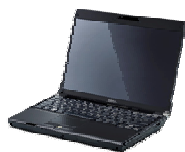
LIFEBOOK P Series

Take advantage of the growing network of wireless working and catch up emails where ever you are via optional embedded UMTS.