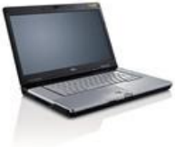
CELSIUS H Series

CELSIUS H Series. Powerful mobile workstation. If you run power-hungry 3D applications that demand no compromise on the graphics side, you'll appreciate the CELSIUS H. The system offers the power of a full-fledged workstation: Editing 3D OpenGL graphics in real time, running computer simulations and computing multimedia animations wherever you are.