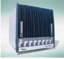
PRIMERGY BladeFrame BF200