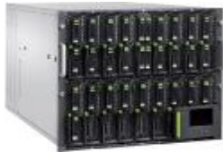
PRIMERGY BX900 S1

The PRIMERGY BX900 S1 is a rack unit that has an installed height of 10U and accommodates 1 to 18 server blades and 1 to 6 storage blades. The energy-efficient Intel Nehalem Quad-Core processors are used in the server blades. Ethernet, Fibre Channel and Infiniband networks are accessed via 8 switch bays. Switches from Cisco, Brocade and Emulex can be used. With its transfer rate of 6.4 Gb/s, the midplane used is the fastest on the market. 100V and 200V power supplies are available. This hardware platform is ideal for server consolidation and virtualization in the datacenter.