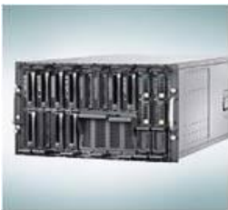
PRIMERGY BX600 S3

The PRIMERGY BX900 S1 is a rack unit that has an installed height of 10U and accommodates 1 to 18 server blades and 1 to 6 storage blades. The energy-efficient Intel Nehalem Quad-Core processors are used in the server blades. Ethernet, Fibre Channel and Infiniband networks are accessed via 8 switch bays. Switches from Cisco, Brocade and Emulex can be used. With its transfer rate of 6.4 Gb/s, the midplane used is the fastest on the market. 100V and 200V power supplies are available. This hardware platform is ideal for server consolidation and virtualization in the datacenter.