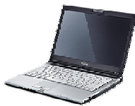
LIFEBOOK S Series

The Fujitsu LIFEBOOK T901 is an ultra versatile lightweight convertible notebook for the professional user. Its brilliant, bi-directional rotatable, high-bright LED display including LED rotation indicators is a pleasure to use. With the LIFEBOOK T901 you can either work with multiple finger-touch or with the multifunctional pen. Berliner Glass ensures highest reliability.