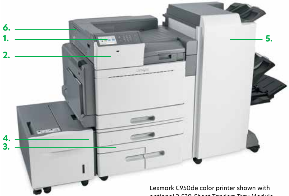
Lexmark C950de color printer shown with optional 2,520-Sheet Tandem Tray Module, Booklet Finisher and 2,000-Sheet High Capacity Feeder.

Reduce unnecessary printing and simplify work processes through solutions applications preloaded on your device. Choose additional Lexmark solutions to fit your unique workflow needs.