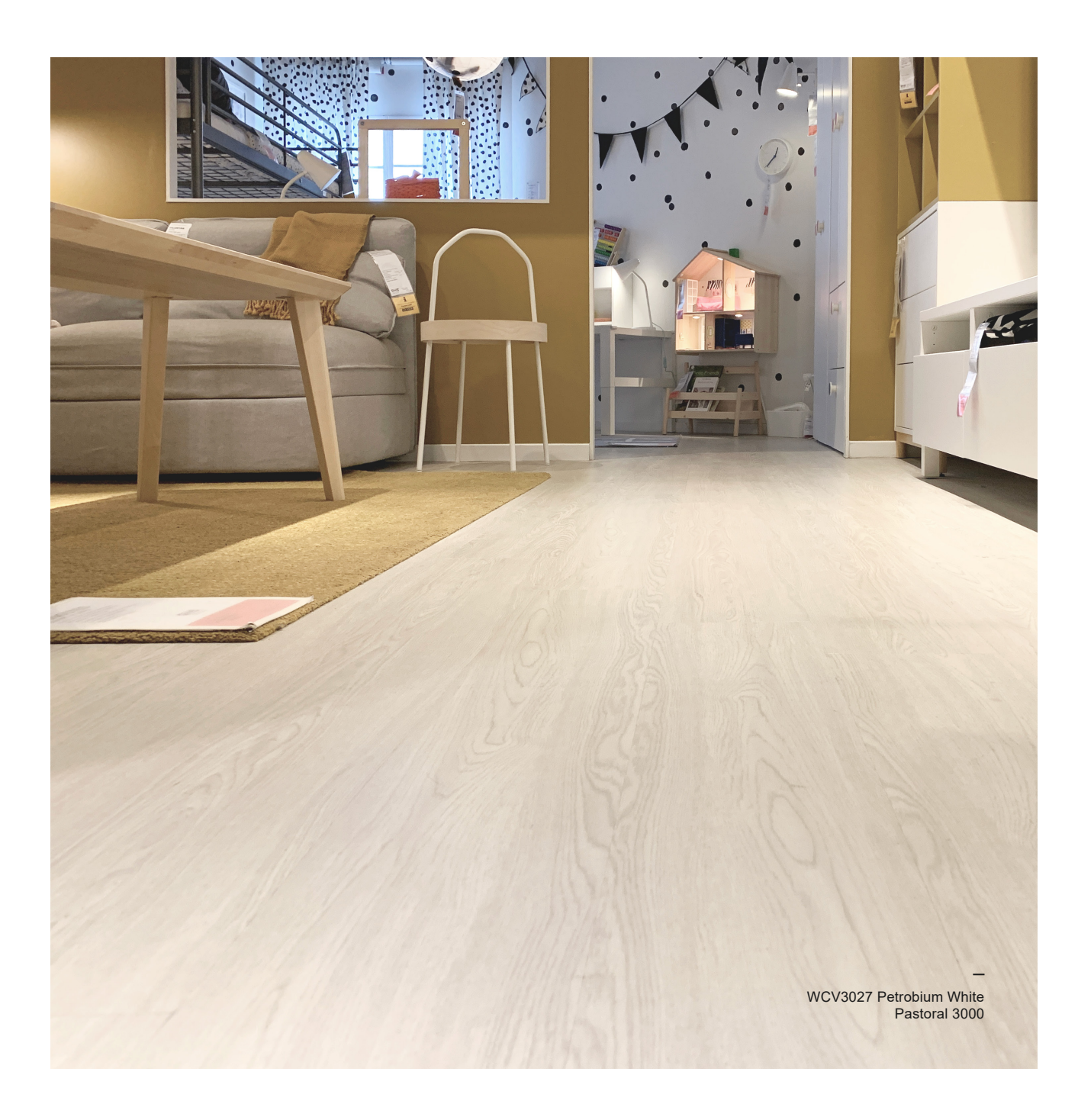
Vinyl planks from the Pastoral collection combines true-to-life wood detail and strength.