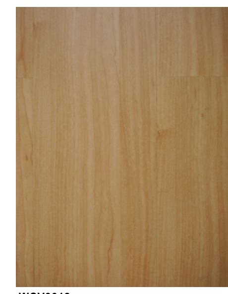
WCV3018 AUTUMN MAPLE