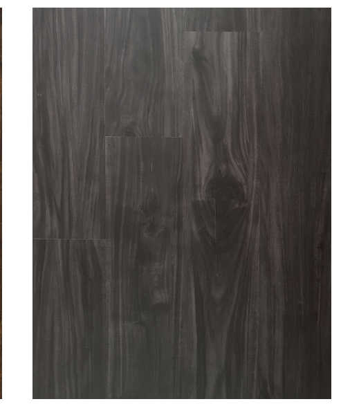
WCV2117 SMOKY ACACIA