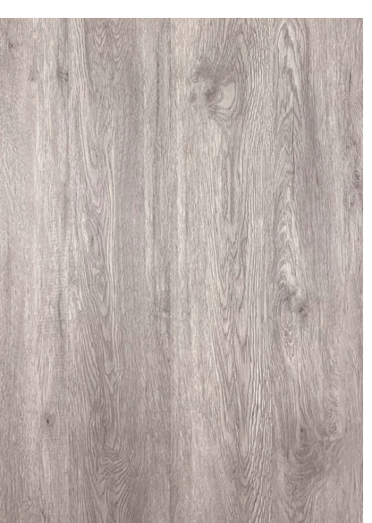
WCV3036 ROMAN SILVER