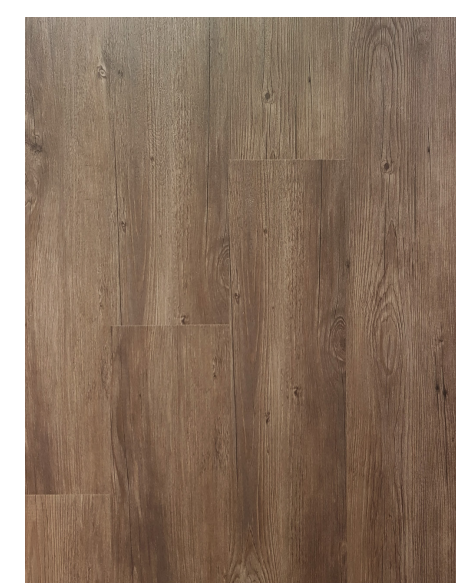
EVP3024V WILLOW OAK