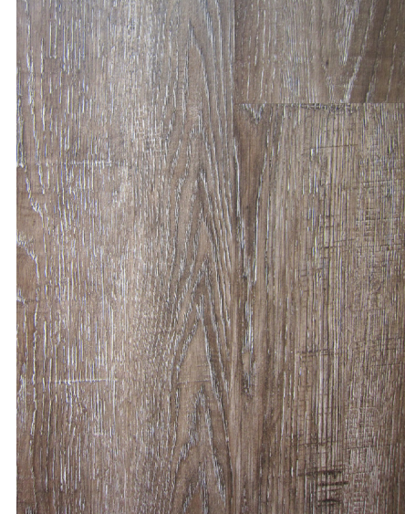
WCV3011 GRACIOUS GRAY