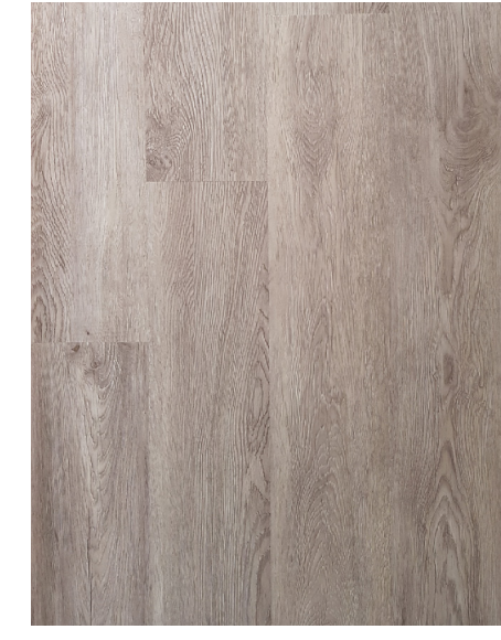
WCV2116 RHYME GREY