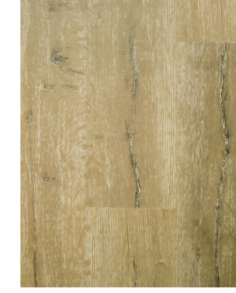
WCV3021 CORAL PINE