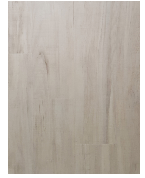
WCV3027 PETROBIUM WHITE