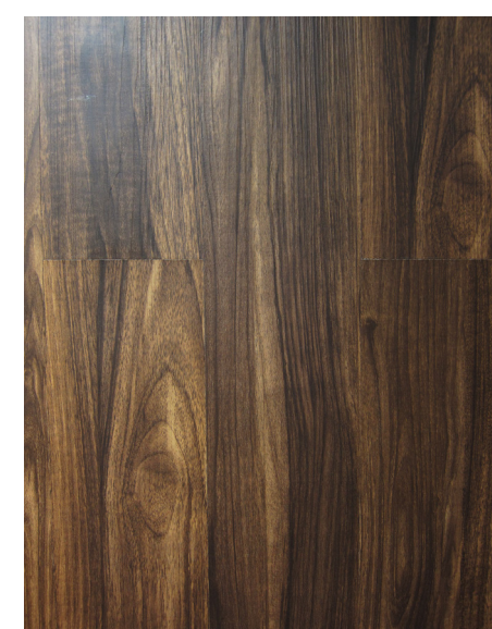
WCV2014 LAUREL OAK