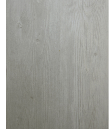
WCV2012 IVORY OAK