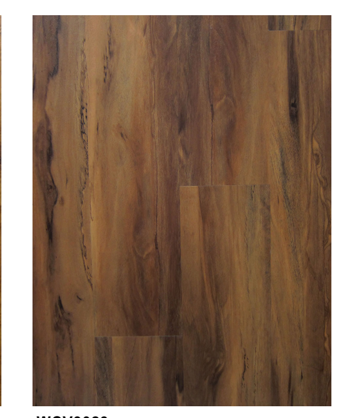
WCV3023 JUGLANS WALNUT