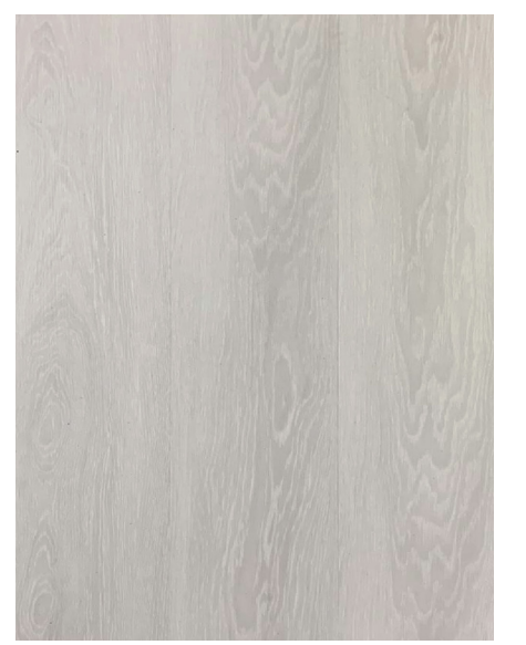
WCV3034 HOARY OAK