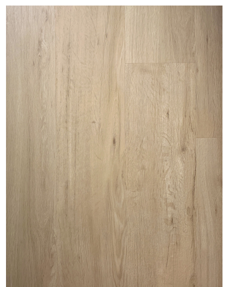
WCV3029 TOFFEE PLANK