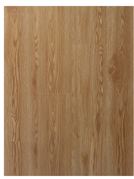
EVP3017V CHERRY OAK