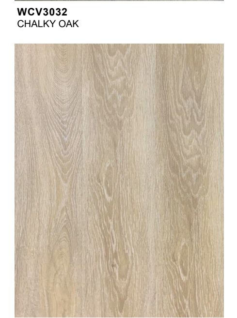
WCV3033 FADED OAK