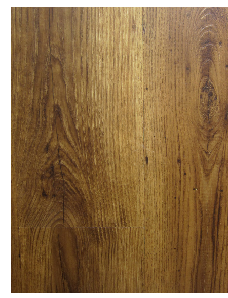
WCV3016 WILD ANCIENT