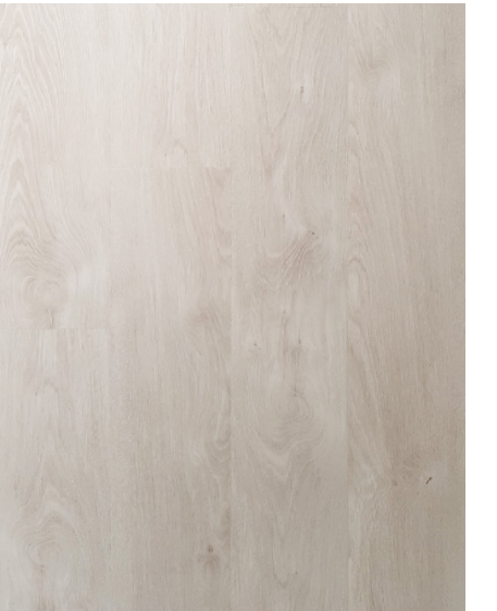
WCV2110 ANAEMIC OAK