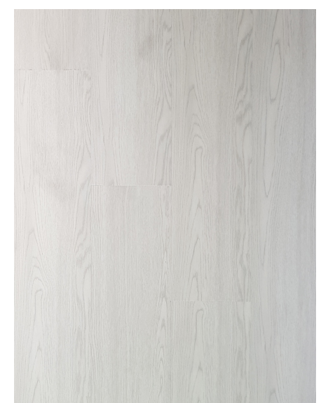
EVP3019V PALEWHITE PINE