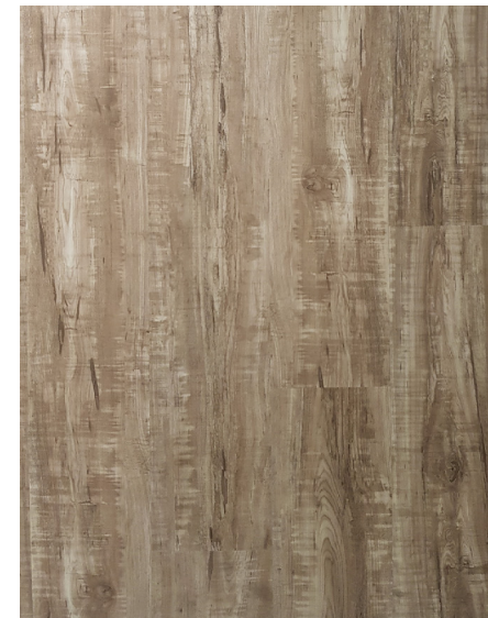
WCV2112 ANTIQUE WALNUT