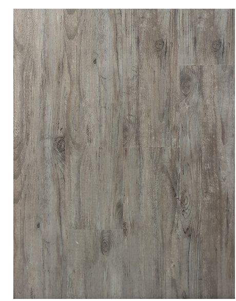
EVP3012 DIMGRAY OAK