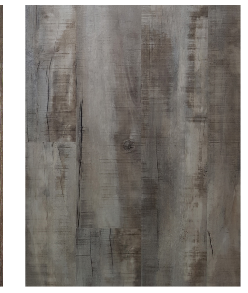
WCV3025 FOREST FROST