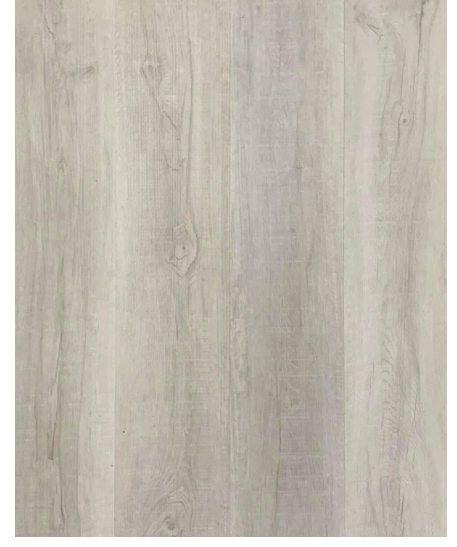
WCV3035 WORN OUT IVORY