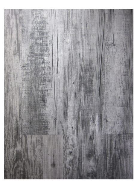
WCV2011 OREGON ASH