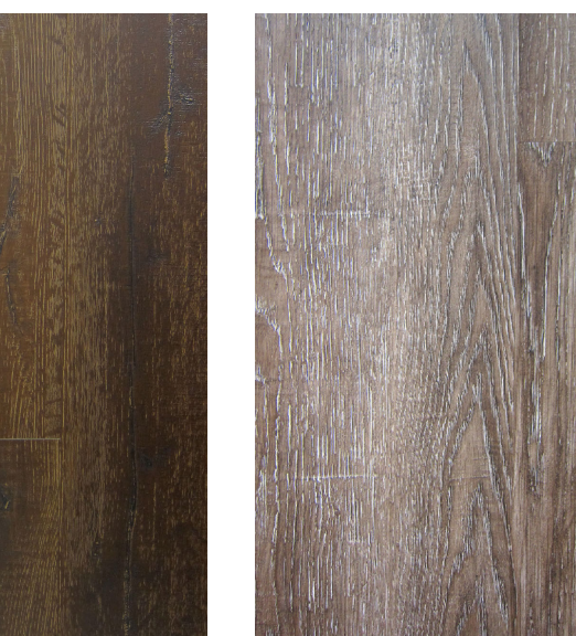
WCV3020 VINTAGE ALAMO DARK