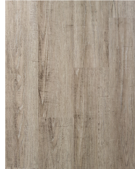
EVP3013V CHOCOLATE ASH