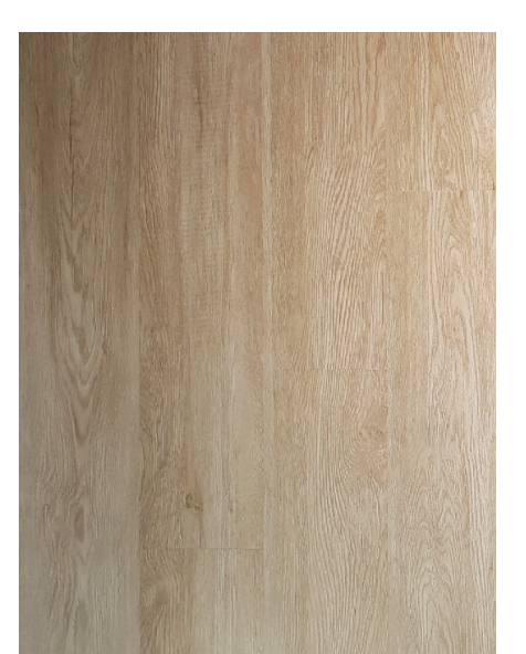
WCV2111 CAPPUCHINO AMBER