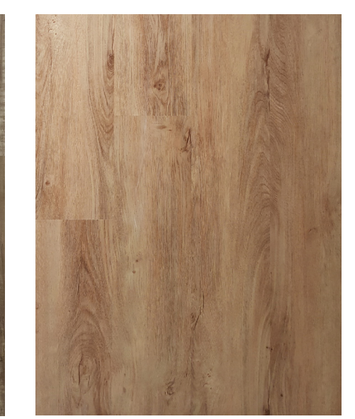
WCV2113 SUNRISE OAK