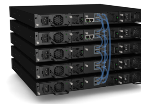
Figure 1: Brocade ICX 6610 Switches can be stacked using four standard 40 Gbps QSFP ports that provide a fully redundant virtual chassis backplane with 320 Gbps of stacking bandwidth.

Brocade ICX 6610 Switches offer eight dual-mode Small Form-Factor Pluggable (SFP)/SFP+ ports, enabling high-bandwidth connectivity to the aggregation or core layers. These ports can be upgraded from 1 GbE to 10 GbE by simply applying a software license, eliminating the need to install a hardware module. In addition, organizations can aggregate these ports across the stack to provide high-speed, redundant links between the wiring closet and the aggregation layer, or between the aggregation and the core layer. With the ability to use short-range and long-range optics, along with copper Twinax cables, the Brocade ICX 6610 supports flexible and cost-effective network architectures (see Figure 2).