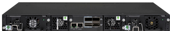
Figure 3: The Brocade ICX 6610 provides four 40 Gbps high-performance QSFP stacking ports (center) and dual, hot-swappable load-sharing power supplies and fan trays (left and right).

Software-Defined Networking (SDN) is a powerful new network paradigm designed for the world's most demanding networking environments and promises breakthrough levels of customization, scale, and efficiency. The Brocade ICX 6610 enables SDN by supporting the OpenFlow 1.3 protocol, which allows communication between an OpenFlow controller and an OpenFlow-enabled switch. Using this approach, organizations can control their networks programmatically, transforming the network into a platform for innovation through new network applications and services. The Brocade ICX 6610 delivers OpenFlow in true hybrid port mode. With Ruckus hybrid port mode, organizations can simultaneously deploy traditional Layer 2/3 forwarding with OpenFlow on the same port. This unique capability provides a pragmatic path to SDN by enabling network administrators to progressively integrate OpenFlow into existing networks, giving them the programmatic control offered by SDN for specific flows while the remaining traffic is forwarded as before. Brocade ICX 6610 hardware support for OpenFlow enables organizations to apply these capabilities at line rate.