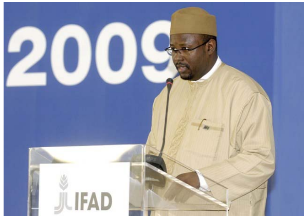
Hon. Dr Sayyadi Abba Ruma, Chairperson of the Council and Governor for Nigeria