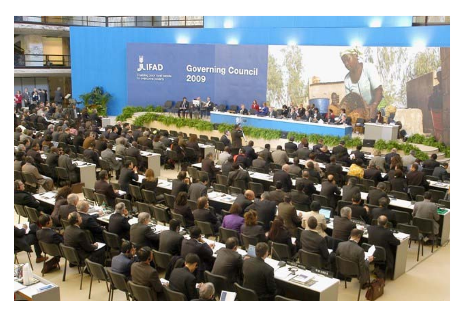
The plenary of the thirty-second session of IFAD's Governing Council