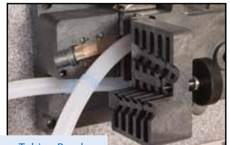
Pump Tubing Bands

The Liquid Detector notifies the controller when liquid is present for precise line rinsing and elimination of missed samples.