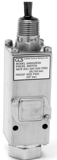
6900GZE SHIPPING WT. APPROX. 19 OZ. (539 GRAMS)