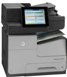
HP Officejet Enterprise Color MFP X585dn

A printing revolution for business. HP Officejet Enterprise MFPs deliver color prints at up to twice the speed and half the cost per page of color lasers plus copy, scan, and fax. 1,2,8 They're designed for advanced workflow—and built to last.