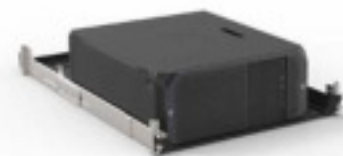
Figure 5. The HP Z4 G4 installed in the HP Z2/Z4/Z6 Depth Adjustable Fixed Rail Rack Kit (2HW42AA)