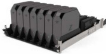
Figure 3. The HP Z2 Mini installed in the HP Z2/Z4/Z6 Depth Adjustable Fixed Rail Rack Kit (2HW42AA) using the HP Mini Chassis and ePSU Rack Mount Brackets (3RW67AA)

The HP Z2/Z4/Z6 Depth Adjustable Fixed Rail Rack Kit includes a set of fixed-rail support brackets that attach directly to the rack and provide a secure mounting platform for the system-tray and workstation. The fixed-rails are adjustable and can accommodate racks that are 24-30 inches deep. The HP Z2 Mini is installed in the vertical position and 7 Minis can fit in the 5U space.