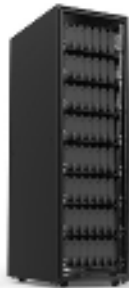
Figure 1. HP Z2 Mini G4 Racked

For the HP Z8 G4 Workstation, HP continues to offer an enterprise-class rail solution that fully extends—allowing for in-rack configuration of the Workstation. Gaining access to the interior components of a rack mounted HP Z8 G4 Workstation is a tool-free operation.