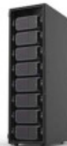
Figure 2. HP Z8 Racked