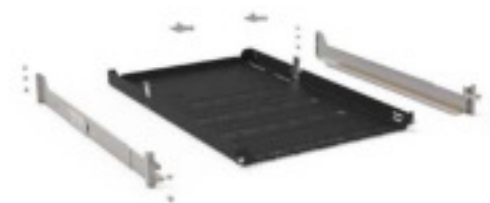
Figure 4. The HP Z2/Z4/Z6 Depth Adjustable Fixed Rail Rack Kit (2HW42AA) exploded view

The HP Z2/Z4/Z6 Depth Adjustable Fixed Rail Rack Kit (2HW42AA) includes a set of fixed-rail support brackets that attach directly to the rack and provide a secure mounting platform for the system-tray and workstation. The fixed-rails are adjustable and can accommodate racks that are 24-30 inches deep. The system-tray is engineered to provide tool-free access to the workstation, allowing the workstation to be serviced without removing it from the rack.