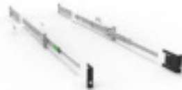
Figure 7. The HP Z640/Z840/Z8 G4 Rail Rack Kit (2FZ77AA) components

For customers looking to upgrade an existing rack mounted HP Z840, HP is offering the HP Z8 Rack Rail Upgrade Kit (2FZ76AA). The kit includes a set of inner slide rails, front flanges, and hardware necessary to perform a seamless upgrade to the new, more powerful, HP Z8 G4—all without removing rack kit hardware from the rack. Simply attach the HP Z8 Rack Rail Upgrade Kit to the HP Z8 G4, remove the HP Z840 from the rack, and replace with the configured HP Z8 G4.