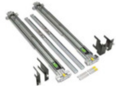
Figure 8. The HP Z8 Rack Rail Upgrade Kit (2FZ76AA) components