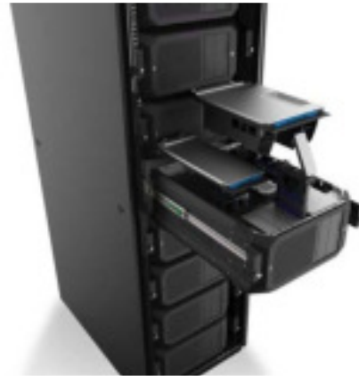
Figure 6. A Rack Mounted HP Z8 G4 installed with an HP Z640/Z840/Z8 G4 Rail Rack Kit (2FZ77AA) showing access to interior Workstation components

The HP Z640/Z840/Z8 G4 Rail Rack Kit rails installs into racks without using tools, making setup convenient and efficient. The inner slide and mounting flanges attach to the computer chassis using a set of screws for added strength and stability. The top mounting holes are concealed underneath the top plastic trim, which must be removed to attach the inner slide and mounting flanges.