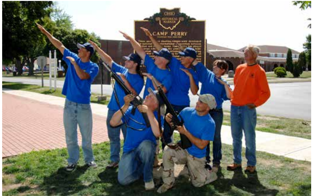
The California Grizzlies O'Connell celebrate as they are named the 2009 National Trophy Infantry Match winners at Camp Perry. The team shot a 1284 to win the match and make history as the first junior team to event claim the trophy.

The group's accomplishments are particularly impressive considering that California State Law prohibits juniors from handling rifles with a removable magazine. In California the team can only practice with a fixed 10-round clip that can only be removed using a tool. This makes training for rapid fire difficult, and the only time the team gets to practice with standard removable clips is when they arrive to Camp Perry for the National