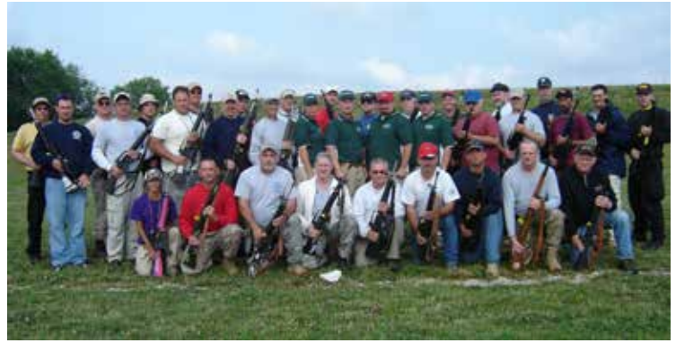
A group of 31 highpower shooters participated in the new Advanced Adult Highpower Rifle Clinic prior to the start of the National Trophy Rifle Matches.

Guided by an instructor, class members paired up, instructed and critiqued each other. “Not only did they help each other here, they will go back home and take that knowledge to their local clubs and fellow shoot-