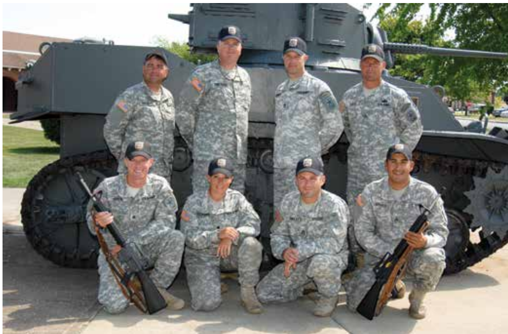
It was a three-peat victory for the USAMU Rifle Team who won the National Trophy Rifle Team Match.