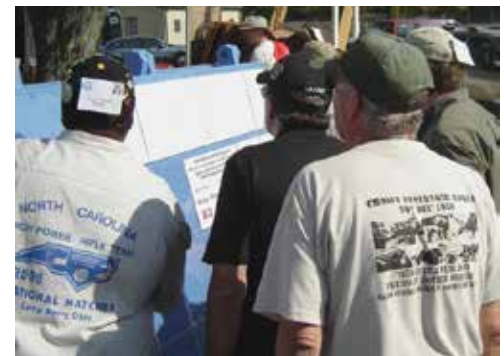
Competitors eagerly check scores in the 2009 National Rimfire Sporter Championship, which took place at Camp Perry, Ohio on 26 July.

"It was a neat match and a lot of fun. My favorite part was getting to shoot three positions