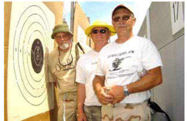
Garand Collector's Association members working in the pits during the Springfield Military Rifle Match.