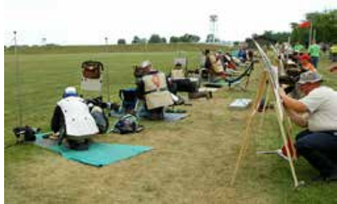
Competitors on the firing line at the conclusion of the President's Rifle Match final at the 2009 National Matches. The 10-shot prone final fired from the 600-yard-line was added in to the President's Rifle Match in 2007.

The top finisher in the President's Trophy Match receive a letter of congratulations from the President of the United States. The tradition began with Theodore Roosevelt in 1904, a renowned advocate of rifle training, who wrote a congratulatory letter to that year's trophy winner. The cut-off for this year's President 100 was a 283-4X. The "President's 100" will also receive President's 100 medallions and certificates.