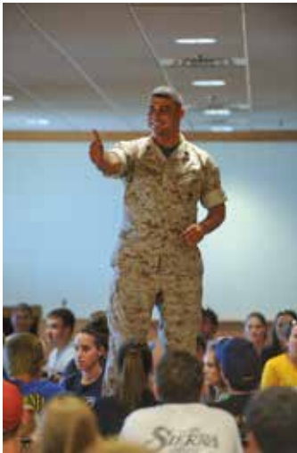
The USMC Highpower Rifle Team gave instruction to about 150 juniors during the CMP-USMC Junior Highpower Clinic prior to the start of the National Trophy Rifle Matches.