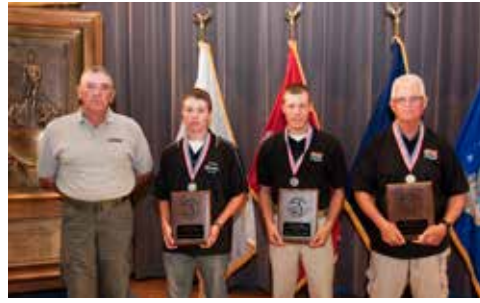
Second place Team, Arizona State Rifle and Pistol Gold, Presenter: GySgt R. Lee Ermev