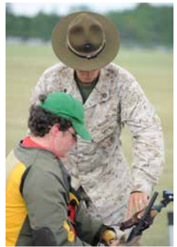
A Marine helps a junior on the range adjust his sling before the firing exercises. Clinic attendees received not only classroom instruction but also hands-on instruction on the range.

At the conclusion of instruction and the EIC Match on Sunday, 2 August, all students received a CMP-USMC Highpower Rifle Clinic T-shirt, a USMC Shooting Team sweatshirt, a certificate of completion and were treated to a pizza party, sponsored by Bushmaster Firearms Inc.