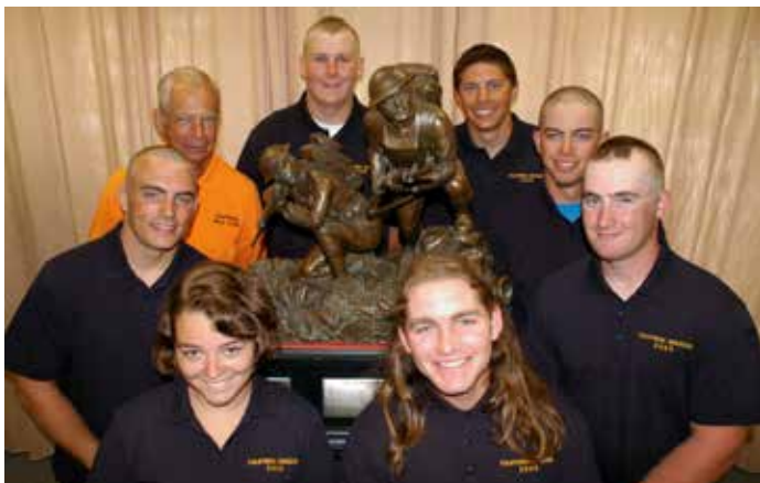
California Grizzlies Team pose with the Infantry Trophy. This is the first time the trophy will be engraved with the winning Junior Infantry Team name.