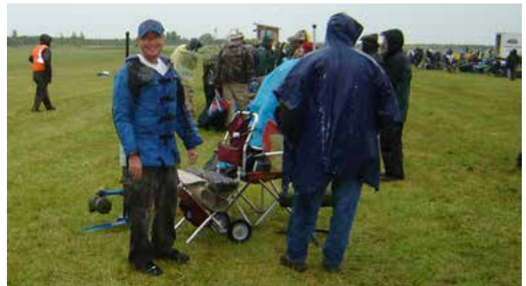
Despite the rain and wind, John C. Garand Match competitors managed to enjoy the day on the range.