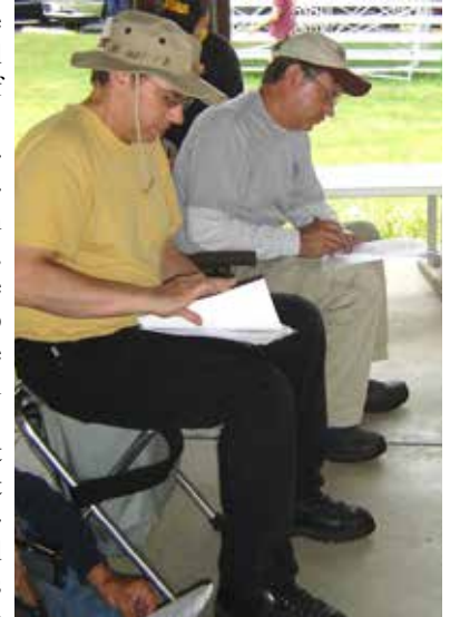
Students in the Adult Clinic took a Final Exam to test their knowledge and skills. At the conclusion of the clinic, each participant received a t-shirt and certificate.

“I’ve seen some guys come out here with a big bag full of toys, not knowing what they’re doing transition into a very accomplished group of highpower competitors who know exactly what they’re doing when they move up on the firing line,” Roxburgh concluded with pride.