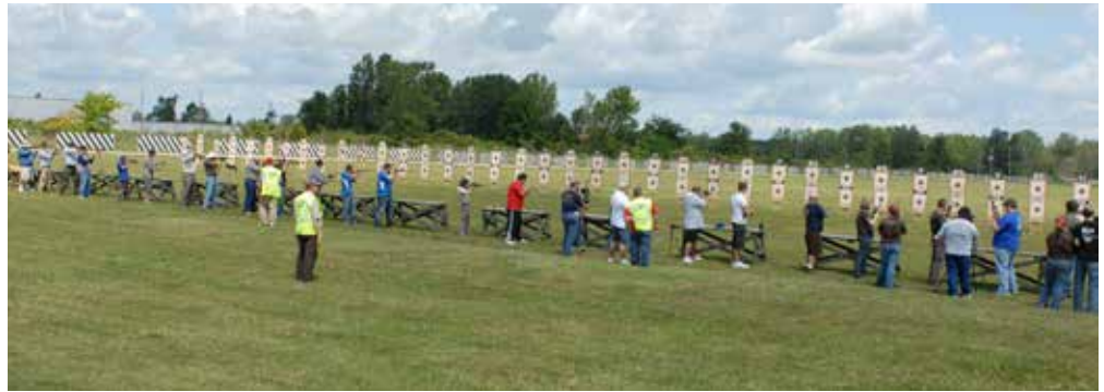
The CMP expanded the Range which included 110 firing points for the 2009 National Rimfire Sporter Match. This was the 8th Annual National Rimfire Sporter Championship and it drew records numbers.