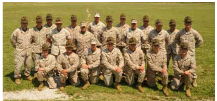
The USMC Highpower Rifle Team consisting of 21 members provided instruction and support for the 2009 Clinic.