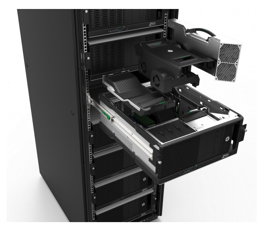
Fig 3 – A Rack-Mounted HP Z820 installed with a HP Z6/Z8 Rack Mount kit (B8S55AA) showing access to interior Workstation components

The HP Z6/Z8 Rack Mount kit rails installs into HP racks without using tools, making setup convenient and efficient. The inner slide and mounting flanges attach to the computer chassis using a set of screws for added strength and stability. The top mounting holes are concealed underneath the top plastic trim, which must be removed along with the rear handle to attach the inner slide and mounting flanges.