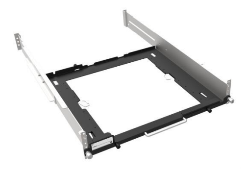
Fig 1 - The HP xw4/Z2/Z4 Rack Mount kit (WH340AA) assembled

The locking system- tray is engineered to provide tool-free access to the workstation. The tray includes release latches to ensure safe removal of the workstation from the server rack and a system ID label for easy identification.