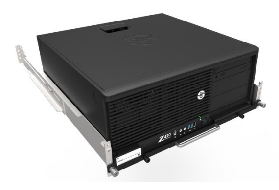
Fig 2 - The HP Z420 installed in a xw4/Z2/Z4 Rack Mount kit (WH340AA)