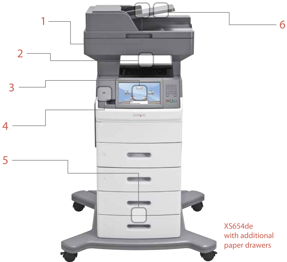
XS654de with additional paper drawers