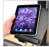
Tablet/Document Holder for WorkFit-S 97-558-200 (black) Includes lift handle