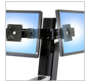
Hinged Bow for WorkFit-S 97-583-009 (black)