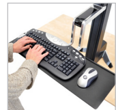
Large Keyboard Tray for WorkFit-S 97-653 (black)