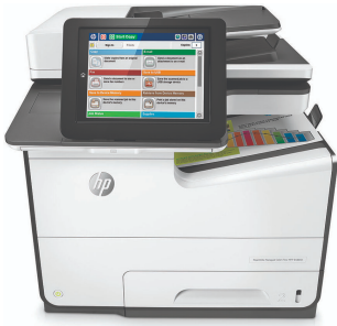
HP PageWide Managed Color Flow MFP E58650z

HP Managed MFPs and printers are optimized for managed environments. Offering increased monthly page volumes and fewer interventions, this portfolio of products can help reduce printing and copying costs. See your HP Authorized Reseller for details.