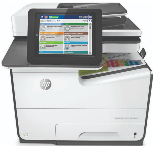
HP PageWide Managed Color MFP E58650dn