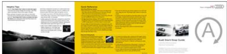
Figure 2. New Start-Stop glovebox insert.