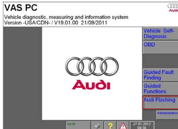
Figure 2. Audi Flashing.